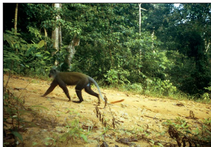
Figure 4. Cercopithecus solatus photo taken using camera trapping, close to Mount Mimongo.

Fifteen camera traps were deployed in a 30-km 2 study area over 54 days between 28 August and 21 October 2004 in an area about 10 km to the south of the southern bank of the Lolo River. No images of C. solatus were obtained. This indicates that the species is either absent or very rare south of the Lolo River. Lauren Coad and local field assistants conducted a hunting study from January 2004 to January 2005 in the same area in two villages, Dibouka (01°19'07"S, 12°12'54"E) and Kouagna (01°18'28"S, 12°13'45"E). Their results showed considerable hunting pressure that was highest within 5 km from the villages, but also extended up to hunting camps 12 km to the north, on the southern bank of the Lolo. During this study all hunting returns for the two villages were recorded, and no C. solatus were ever caught or seen. During a previous hunting study in these villages conducted by Malcolm Starkey from 2000 to 2002, no C. solatus were