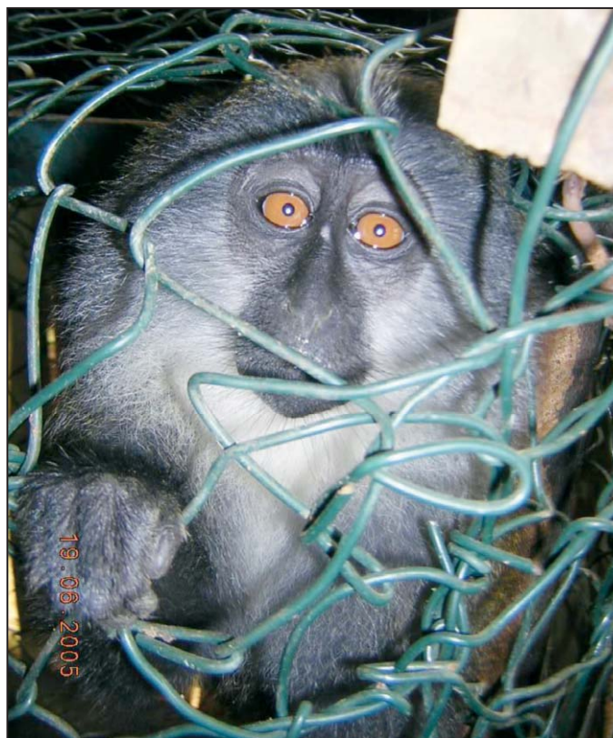
Figure 3. Young female Cercopithecus solatus captured in the buffer zone of Mount Birougou National Park, southern Gabon, in June 2005.

villagers brought him a juvenile female in early June 2005 (Fig. 3). It had been caught in a ground snare in the northeastern buffer area of Mount Birougou National Park, in a hilly area (altitude 600 m). In the early afternoon of 8 March 2004, Tanga observed a single adult resting on a tree branch at the forest edge along the road between Popa and Mbigou Moréné (01°31'12"S, 12°17'24"E; altitude 355 m; Lolo-Bouenguidi Department, Ogooué-Lolo Province).