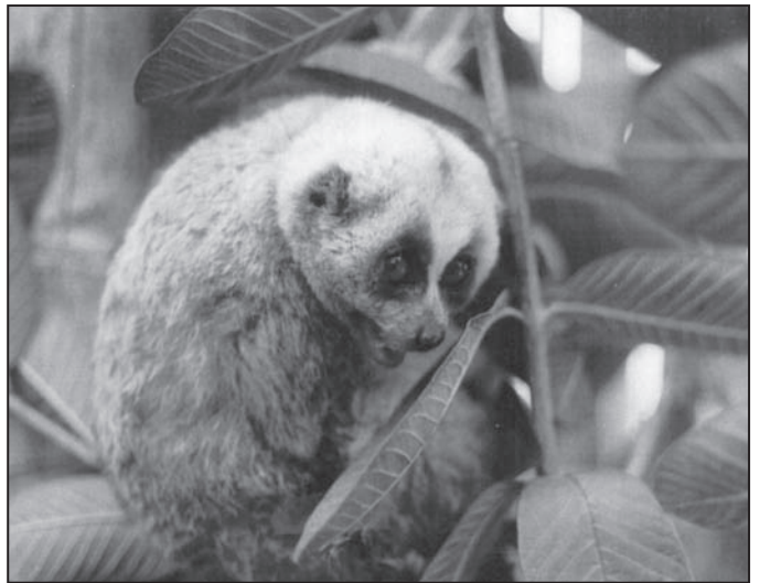
Photo 4. The slow loris, Nycticebus bengalensis , is being hunted for wildlife trade throughout its range in Asia.