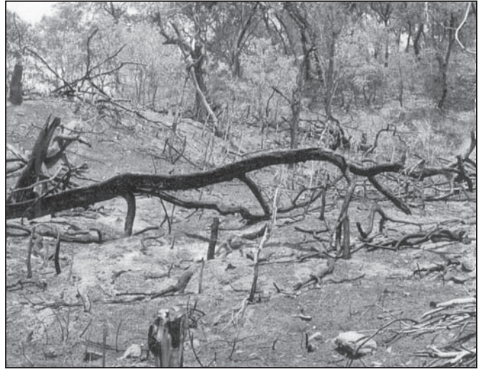
Photo 2. Golden langur habitat near Ultapani (Chirrang Reserved Forest) cleared for cultivation.