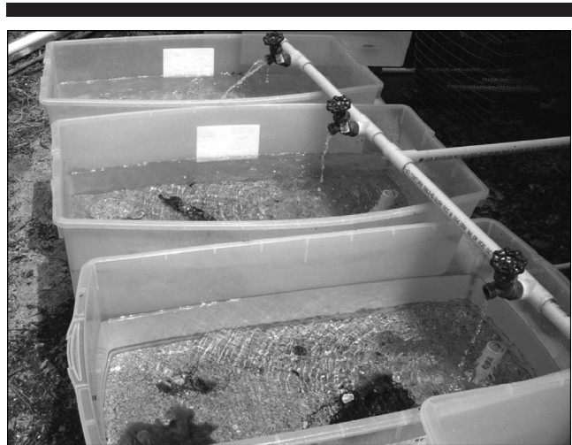
Figure 1. Experimental bioassay design showing the three-container control series. Each container contained 23 kg of proportioned sediment and approximately 38 L of saltwater.

Experiments were arranged in a single row and consisted of five, three-container series (for a total of 15 containers) that each tested a specific natural sand/glass cullet matrix. The first series served as a control with 100% natural sand, whereas the second series of containers tested a matrix of 75% natural sand and 25% glass cullet. The third series of containers tested a 50% natural sand/50% glass cullet mixture, and the fourth series of containers tested a mixture of