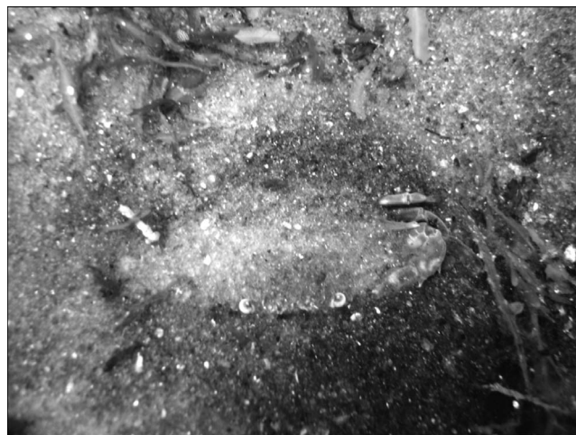
Figure 4. Sargassum crab ( Portunus sayi ) using recycled glass cullet as camouflage. This defensive measure caused no adverse effect to the crustaceans.

After a 2-month exposure to recycled glass cullet sediments, it has been determined that an artificial cullet sub-