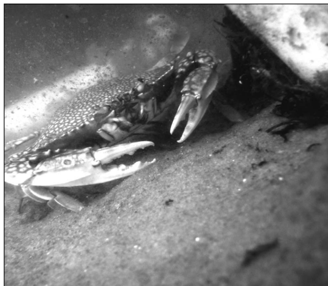
Figure 2. Example of macrofauna, blue crab ( Callinectes sp.), introduced to a 100% cullet substrate.

ing a 2.3-kg sample of “live” sand from established (nitrogen-cycled) native reef display tanks. A 1-week acclimation and colonization period was allowed before monitoring was initiated. Biological monitoring of microfaunal test organisms was conducted through weekly interstitial core analysis. A 50.10-g interstitial core sample was extracted from each test matrix with a 50-cm-long piece of ½-inch (1.3-cm) PVC pipe and a stopcock. Core samples were taken on a weekly basis and analyzed for the presence or absence of microfauna under a trinocular video microscopy system at a total magnification of 400×. Microfauna were identified by external characterization, and the active status of individuals was documented with a digital camera. In addition, five random core samples from each matrix were extracted weekly and fixed with HICO microscope fixing agent. At a total magnification of 400×, the field of view (diameter = 0.125 mm) was divided into four equal quadrants to observe whether colonization was interstitially uniform. When a microorganism was observed within