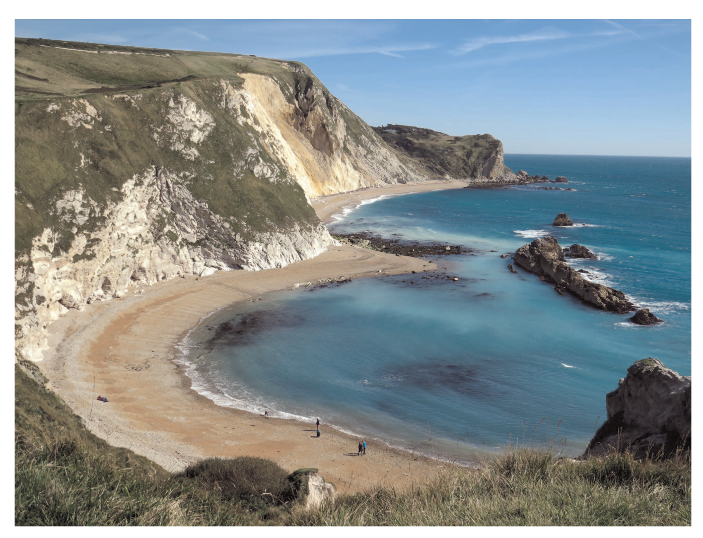
Man O'War Bay along the Jurassic Coast of Dorsett, southern England. The Jurassic Coast is a designated World Heritage Site along the English Channel coast of southern England. Stretching a distance of nearly 155 km, this segment of coastline provides over 180 million years of coastal geologic history through the presence of Triassic, Jurassic, and Cretaceous cliffs. The coast is also unique in that stretches of both concordant and discordant shorelines can be found, along with a plethora of coastal landforms. For example, in Man O'War Bay, as shown above, the limestone has been tilted up so forcefully by regional folding and faulting that a nearly vertical orientation now exists at this location. Of particular interest is that this resistant bed of limestone results in forming an offshore barrier, partially protecting the Bay from wave attack and erosion.