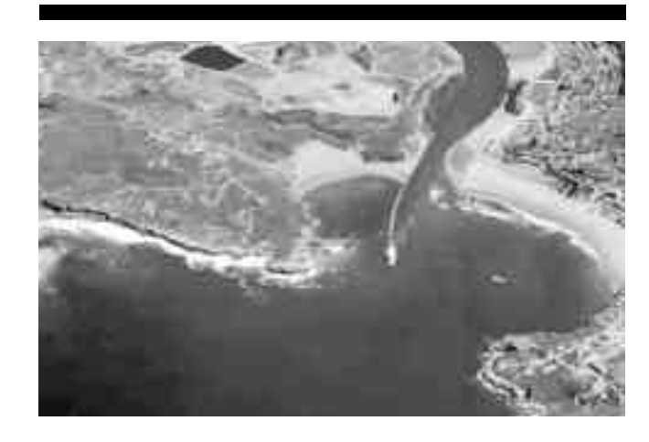
Figure 9. An aerial view of Cuchía beach (Cantabrian, Spain)

Figure 9 shows an aerial view of Cuchía beach and Suances estuary. A panoramic of Cuchía beach after rehabilitation is depicted in Figure 10.