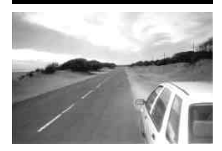
Figure 2. Existing road alongside La Bota beach (Huelva, Spain), Gómez-Pina 1997.