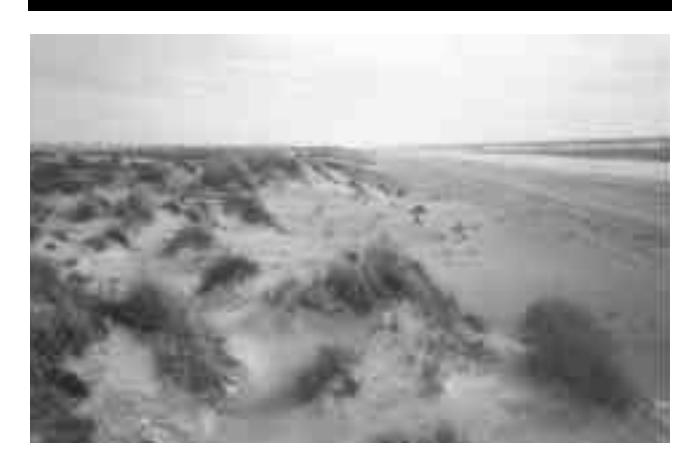
Figure 13. Dune blow-outs in Isla Cristina beach (Huelva, Spain)

La Lanzada isthmus is one of the most emblematic beaches in the province of Pontevedra (North Atlantic façade). The direct burden on the beach caused by tourism and a bad commuting road system on the foredune itself made the whole dune system and beach very vulnerable. The goal of the dune restoration project was very challenging trying to both eliminate the main dune problem (the road) and reinforce the primary frontal dunes. The demolition of the existing public road across the dunes and the construction of an alternative road further inland from dunes was a controversial social issue that was, in the end, well accepted. Willow sand fencing and transplanted vegetation was used to rebuild the dune areas damaged by the road. Damage to dunes from pedestrian traffic was avoided by the use of elevated walkovers constructed parallel and perpendicular to the beach. Selective areas were