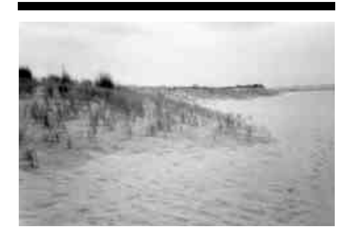
Figure 12. La Lanzada beach (Pontevedra, Spain) afterdune restoration