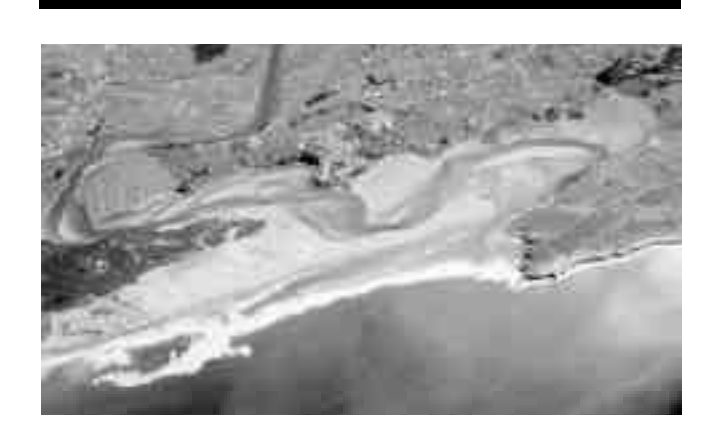
Figure 6. An aerial view of Liencres spit (Cantabrian, Spain) after breaching.