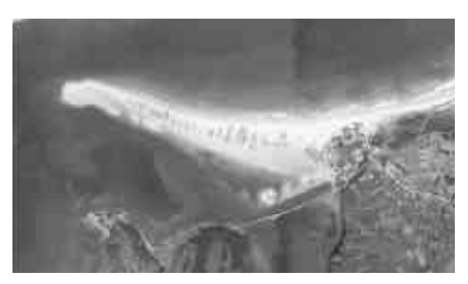
Figure 3. An aerial view of Somo spit (Cantabrian, Spain) before dune restoration.

The Somo spit, located in Santander (Cantabrian sea), is a very distinctive spit formation in Santander bay. The spit dimensions are approximately 2,500 m long by 150 m wide,. In the central section a dune system is formed, acting as a buffer against high-energy storm waves, preventing or delaying intrusion of water and sediment into inland areas. This natural spit formation has been subjected to important