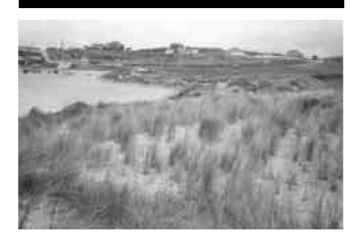
Figure 10. Cuchía beach (Cantabrian, Spain) after dune restoration