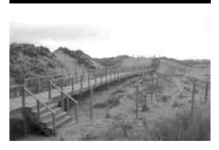
Figure 8. Dune walkover and fencing in Liencres spit (Cantabrian, Spain)

Figure 6 depicts an aerial view of Liencres spit after dune breaching. In Figure 7 sand accumulation caused by willow fences can be seen. Elevated dune walkovers and fencing are shown in Figure 8.