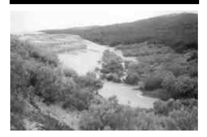
Figure 17. A view of Valdevaqueros backdune restoration (Cádiz, Spain)

(approximately 150,000 m³/year eastward) by the Carreras and Guadiana entrance river jetties.