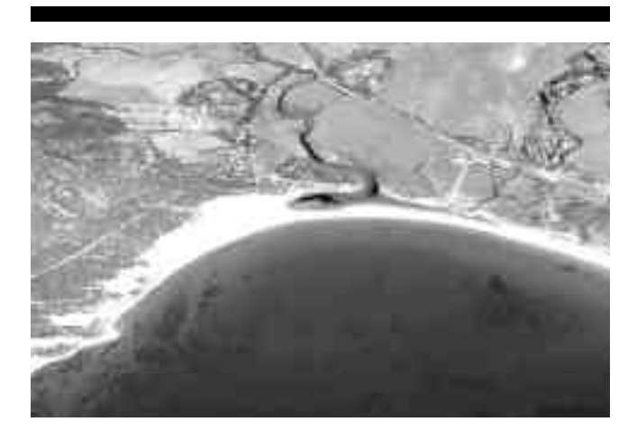
Figure 16. An aerial view of Valdevaqueros cove (Cádiz, Spain)

The relatively high longitudinal net sediment transport along the Huelva coast (up to 400,000 m³/year eastward) together with littoral drift interruption by the harbour entrance jetties, decrease sediments by river discharge and urbanisation developed too close to the beach generally expose Huelva beaches and foredunes to high erosive rates. Isla Cristina beach is one of the representative Huelva tourist beaches showing beach and foredune erosion due to the conjunction of the aforementioned causes and in particular to the interruption of the littoral drift