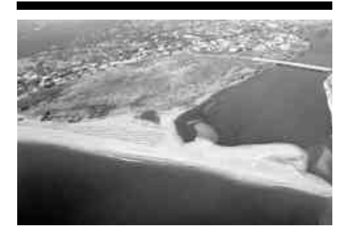
Figure 19. An aerial view of Guadalquitón estuary after restoration (Cádiz, Spain)