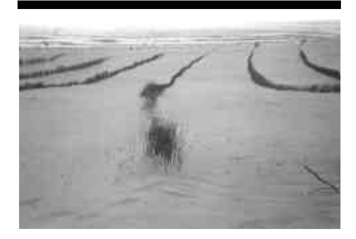
Figure 18. A view of Valdevaqueros accreted foredune after restoration (Cádiz, Spain)

At present a second phase is being carried out with the aim of re-establishing the natural dune equilibrium based on the experimental results obtained in the first project phase. Also an integrated dune management program is under study in order to minimize human negative impact on the whole dune system.