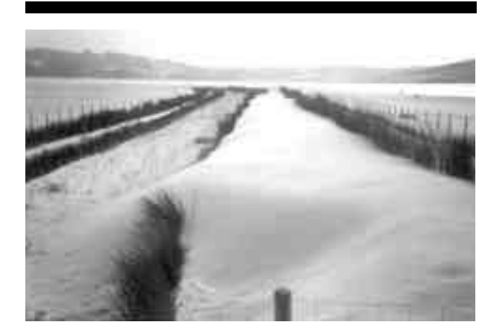
Figure 7. A detail of dune restoration in Liencres spit (Cantabrian, Spain)