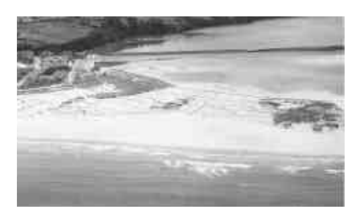
Figure 4. An aerial view of Somo spit (Cantabrian, Spain) after dune restoration.

Liencres spit, located in the mouth of the Pas river and is one of the most important spit formations in the Cantabrian sea, not only for its dimensions but also for its natural and ecological value. The Liencres' wide dune system has suffered a continuous process of degradation due to former extensive sand mining, excessive tourist pressure and also from the occurance of several unfavourable wind, tides and storm events. As a result, the seaward dune face was undermined and collapsed, loosing vegetation and becoming very vulnerable. Dune restoration works ended in 1999 consisting, as in Somo spit, of the use of sand trappers, transplanted vegetation, fencing, walkover construction and educational posters.