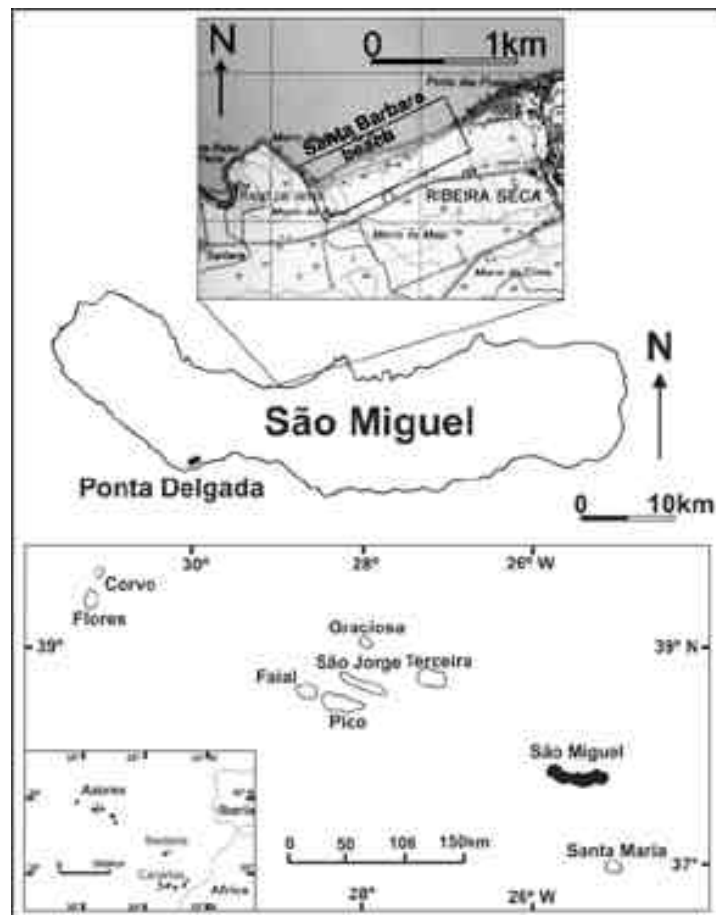
Figure 1. Location of the Azores archipelago and of the study area.

legal constraints to this type of mining activity as well as the inexistence of proper coastal management plans. This ultimately triggered uncontrolled erosion of these coastal features. This situation was only halted in the middle 1990's, yet by that time most of the mining sites had already been damaged or destroyed, with the nearby coast showing clear symptoms of sediment starvation.