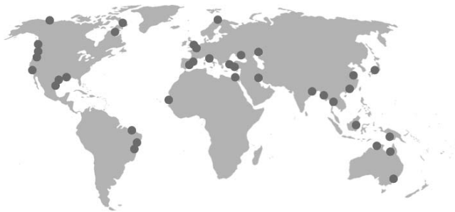
Figure 1. Location of the deltas aged by Stanley and Warne (1994).

determined by coral dating) to identify a SLR tipping point of delta initiation.