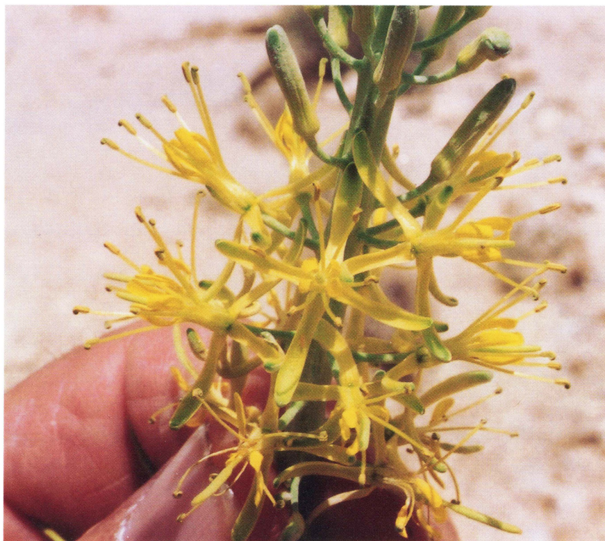
FIG. 3. Stanleya pinnata var. texana , flowers at anthesis.

1963, Correll & Wasshausen 27851 (LL, SRSC); W of Agua Fria Mt., 13 Apr 1936, Cory s.n. (GH); 6 miles NE of Agua Fria Springs, 13 Apr 1936, Cory 18569 (GH); Terlingua Creek, Sep 1883, Havard 70 (GH); desert washes near Terlingua, 1 Apr 1942, Nelson & Nelson 5027 (GH, TEX); 4.6 mi WSW along road to Agua Fria Mt., betonite clay hills with sparse vegetation, 11 Apr–26 May 1981, Powell 3604 (SRSC, TEX); Road to Agua Fria Mt., W of highway 181, 26 May 1984, Powell 4342 (SRSC, TEX); ca. 5 mi W of Highway 118 along Agua Fria 1985, Poole 2640a (TEX); common locally, 3.5 mi N of Terlingua, road, 18 Apr 1961, Rollins & Correll 6191 (GH, LL); 3 mi SE of Hen Egg Mt., 12 Jun 1949, Turner 1088 (GH, SRSC); N of Terlingua ca. 10 mi, 3 Apr 1938, Warnock C303 (GH, SRSC, TEX) gyp flats N of Agua Fria Mt., 31 Jul 1961, Warnock 18513 (SRSC, TEX).