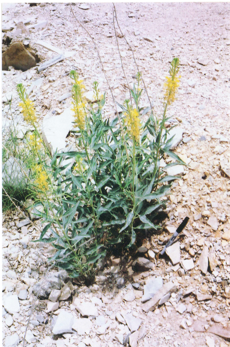
FIG. 2. Stanleya pinnata var. texana at type locality.

secondary inflorescences 20–30 cm long. PEDICELS ca. 1 cm long. SEPALs of mature buds (just before dehiscence) ca. 8 mm, elongating to 8–10 mm. PETALS 8–9(–10) mm long, the blades 4–5 mm long, the claws densely hispidulous, 4–5 mm long. STAMENS 6 (4 long and 2 short), the longer extending about 2 mm beyond the petals, hispidulous below. FRUITING PEDICELS ca. 1 cm long. PODS 5–8 cm long, torulose, gla-