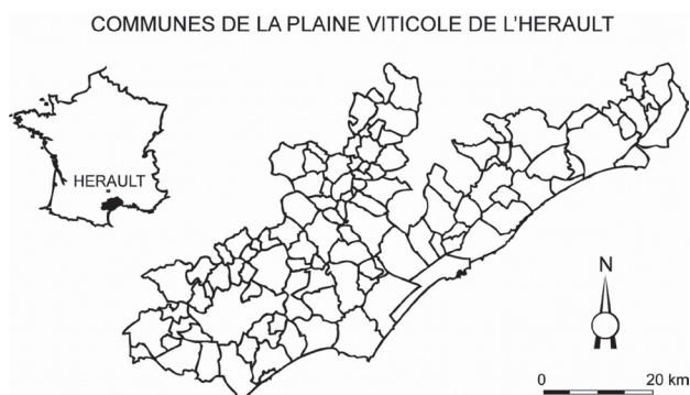
Fig. 1. Map of the study area with communes (INSEE).

important types of agriculture are grasslands (7 %), cereals (6 %) and fruit orchards (3 %). Natural or semi-natural vegetation is dominated by Mediterranean evergreen shrub lands (6 % of the region's surface) and forests (5 %). Urban land occupies about 8 % and wetlands about 10 % of the region.