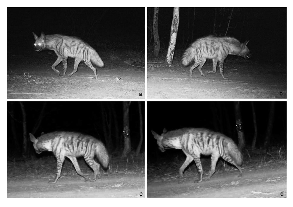
Fig. 3. The asymmetry of striped pattern on two flanks of the same striped hyena HYC-4 (a, b), and example of unambiguous identification of the same striped hyena HYC-5 (c, d).

The program CAPTURE (White et al. 1982, Rexstad & Burnham 1991) was used to analyze the capture and recaptured photograph data of striped hyenas. The survey duration was 30 days at each zone, and thus kept short in relation to expected demographic