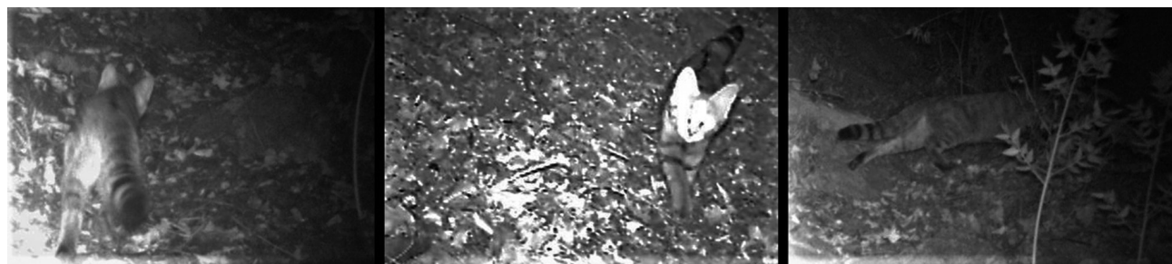
Fig. 1. Some of the wildcats photographed during the camera-trapping survey. According to their body-size, the first and the third were adult, the second was a juvenile.