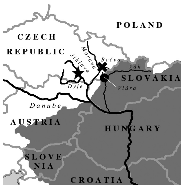
Fig. 2. Distribution of the Balkan spiny loach in and around the Czech Republic. Historical distribution = grey, signs indicate positive localities in the Czech Republic: cross = first finding in the River Bečva in 1943, spot = recent finding (2001) in the River Vlára, asterisk = new finding (2016) in the River Jihlava.

12V) backpack electrofishing gear, pulse amplitude: 200 V PDC, frequency 60 Hz; producer Bednár, Czech Republic; ii/ fishing set – Honda Electric Generator 2 kW, output 230 VAC with control panel BMA PLUS, output voltage (peak level): 300-600V, frequency: 50 Hz; producer Bednár, Czech Republic).