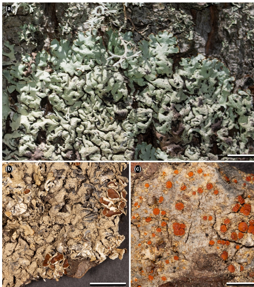
Figure 2. Blastenia monticola and Hypogymnia laminisorediata , general habit. A: H. laminisorediata on P. heldreichii in site Yavorov Chalet. B: H. laminisorediata SOMF 24313, locality 14-12, on P. peuce . C: B. monticola SOMF 31122, locality 14-3, on P. heldreichii . Scale bars: A and B = 1 cm, C = 2 mm.

However, a specimen of L. cadubriae collected by A. Vězda (14-15) was found, and the species was also collected during the fieldwork at the site Treshtenik Chalet (15-4).