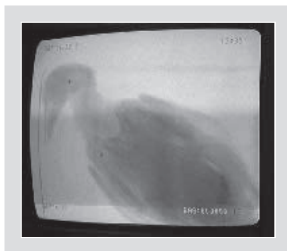
Figure 2. Standard airport security X-ray equipment was used to identify embedded shot. This common eider carries one pellet in the head and one in the breast muscle.

A total of 993 birds, i.e. 879 common and 114 king eiders, were examined for embedded lead shot by either passing them ( N = 764 birds) through an airport security check X-ray device (Schlumberger Controlix 2E) at Nuuk Airport with parallel colour and B/W monitors connected, or by taking high resolution X-ray photographs (35 × 40 cm) at the local hospital in Nuuk ( N = 229 ). The first method was applied to most drowned birds, whereas the latter method was used to safely distinguish between embedded shot and the larger pellets used to collect some samples. To verify the ability of the airport X-ray equipment to detect pellets, a sample of 10 birds with lead shot was inspected using both methods. The number of pellets in each carrier was counted, and in case more than one size of lead pellets could be identified (disregarding the large pellets used in sampling some of the birds) the number of each pellet size was recorded. For the wounded birds, notes were taken on the approximate position of the pellet(s), i.e. in the body, head, wings, legs or rump (Fig. 2).