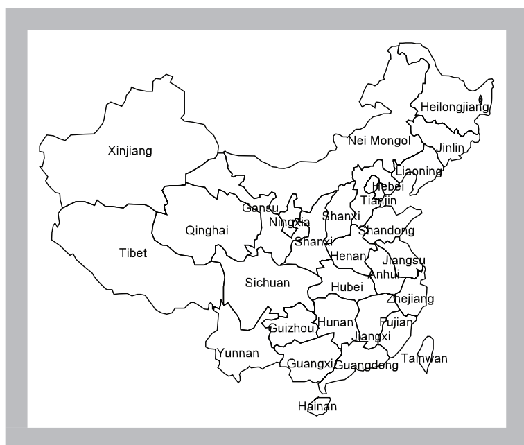
Figure 1. Location of the Wupao Forest Farm in the Wandashan Mountains, the province of Heilongjiang, northeastern China.

cold winters and short hot summers. Annual average temperature is 2.2^{\circ}\text{C} , and extreme temperatures range within -34.8^{\circ}\text{C} - 34.6^{\circ}\text{C} . Average annual precipitation ranges within 500-800 mm. The frost-free period is 120 days, and it lasts from late April to late September. Snow accumulates in late November, persists until end of April, and total snowfall averages approximately 40 cm.