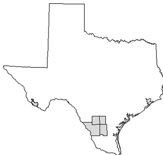
Figure 1. Approximate location of study sites in western Texas (WTX; the Big Bend Ranch State Park) and southern Texas (STX; La Salle, McMullen, Webb and Duval counties).

Data were collected from two ecoregions in Texas: the Rio Grande Plains of southern Texas and the Trans-Pecos Mountains and Basins of western Texas (Fig. 1). The southern Texas (STX) population was studied on private lands on which harvest was unrestricted. The western Texas (WTX) mountain lion population was studied on the Big Bend Ranch State Park, in which they are protected from harvest due to park regulations. In STX, we collected data from a 2,683-km 2 study site consisting of privately owned lands along the Nueces River between Cotulla, Tilden, Freer and Encinal, Texas. Elevation ranged from 90 to 208 m a.s.l. (Gabriel et al. 1994) and precipitation averaged 64 cm. Soil composition