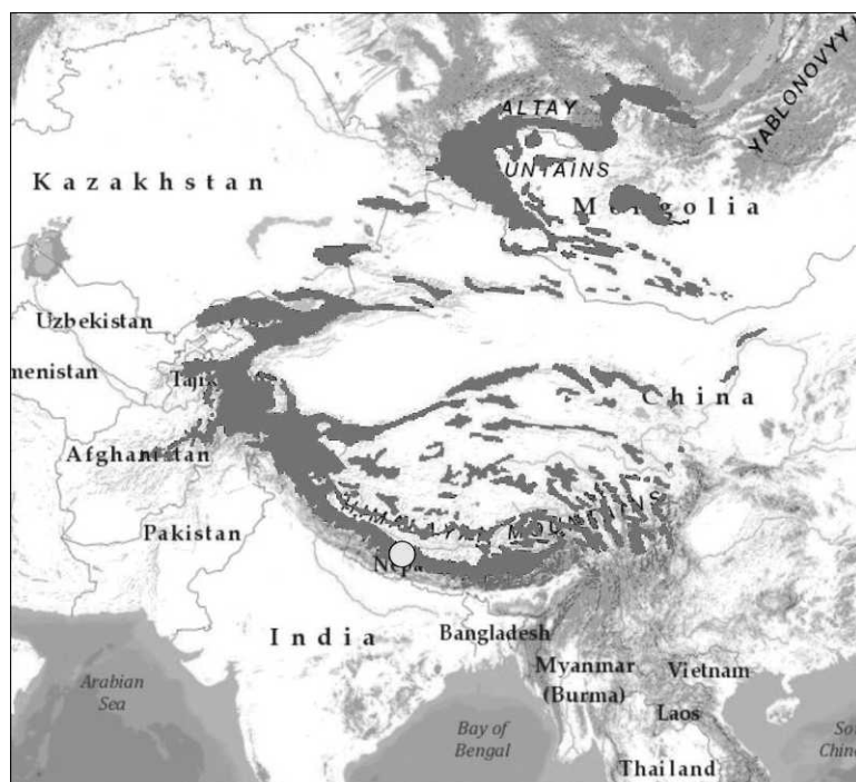
Figure 1. Global distribution of snow leopards, redrawn from Fox (1994). Our study area in Nepal is indicated by the circle displayed on the map.

prey, but like other large felids, it prefers larger ungulates because these confer most net energetic gain per unit effort expended. Thus, throughout its wide range, bharal (blue sheep/naur) Pseudois nayaur and Asiatic ibex Capra ibex constitute its preferred and stable, natural diet.