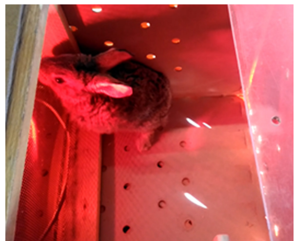
Figure 2. Recovery of body temperature in a box with infrared light heating regulated by thermostat.

fence. Extreme outliers were only found in the temperature measurement and were not removed due to small sample size and clustering. Values biologically non-logical (e.g. heart or