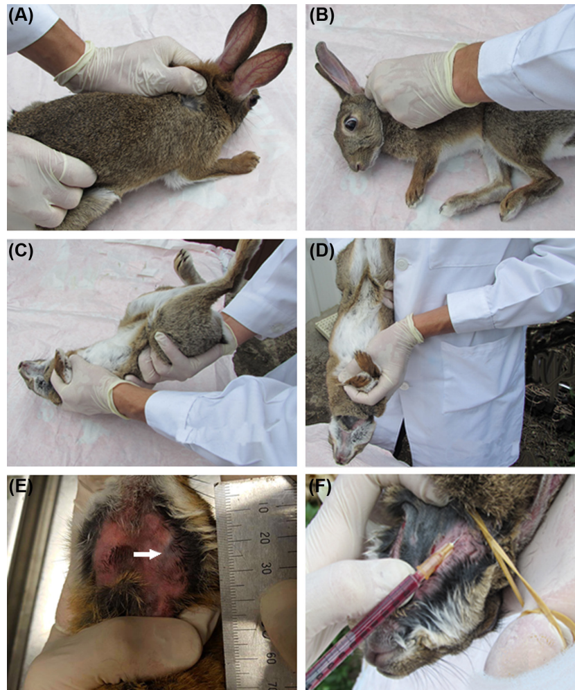
Figure 1. Sequence of procedures for containment and presentation of the animal for blood collection. First approach (A), lateral decubitus (B), dorsal decubitus (C), presentation of the animal for blood collection (D), visualization of external jugular vein (E) and blood collection (F). The arrow indicates the beginning of the external jugular vein. Cranially at this point are the linguofacial and retromandibular veins.

During handling, a small ear biopsy was obtained from a subset of the captured rabbits ( n = 12 ) and kept in 96% ethanol until further analysis. Additionally, samples from five domestic rabbits were obtained for comparative purposes. Genomic DNA was extracted using the EZNA DNA purification kit (Omega) following the manufacturer's guidelines. Two molecular markers were amplified via PCR to infer the taxonomic status of the analysed rabbits: the mitochondrial control region and the first intron of the coagulation factor IX (F9) gene (X chromosome). Obtained sequences were compared with those published in public databases for subspecies inference. The details of the protocol are not revealed in this study because they are not within its scope.