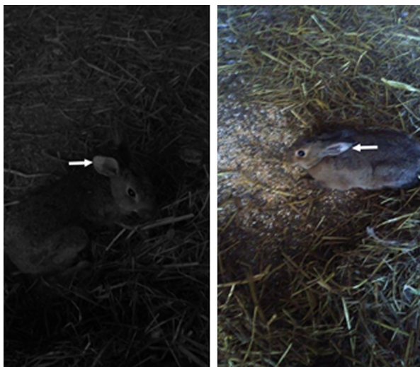
Figure 4. Photographs taken after release of the rabbits. Left- at night (arrow indicates the marking on the ear); right-during the day (arrow indicates the marking on the ear).

From our experience, restraint of the animal by an experienced person and correct identification and visualization of the EJV proved critical to guarantee the success of the procedure, in the first attempt. Presenting the animal correctly to the person in charge of the venepuncture was essential for visualization and less deviation of the EJV, located laterally to the midline and overlying the internal jugular vein and the carotid artery. Shaving the neck over the midtrachea cranial to the thoracic inlet (Quesenberry and Carpenter 2012) can be carried out for a better EJV visualization. If shaving must be performed, electric hair clippers with thin blades