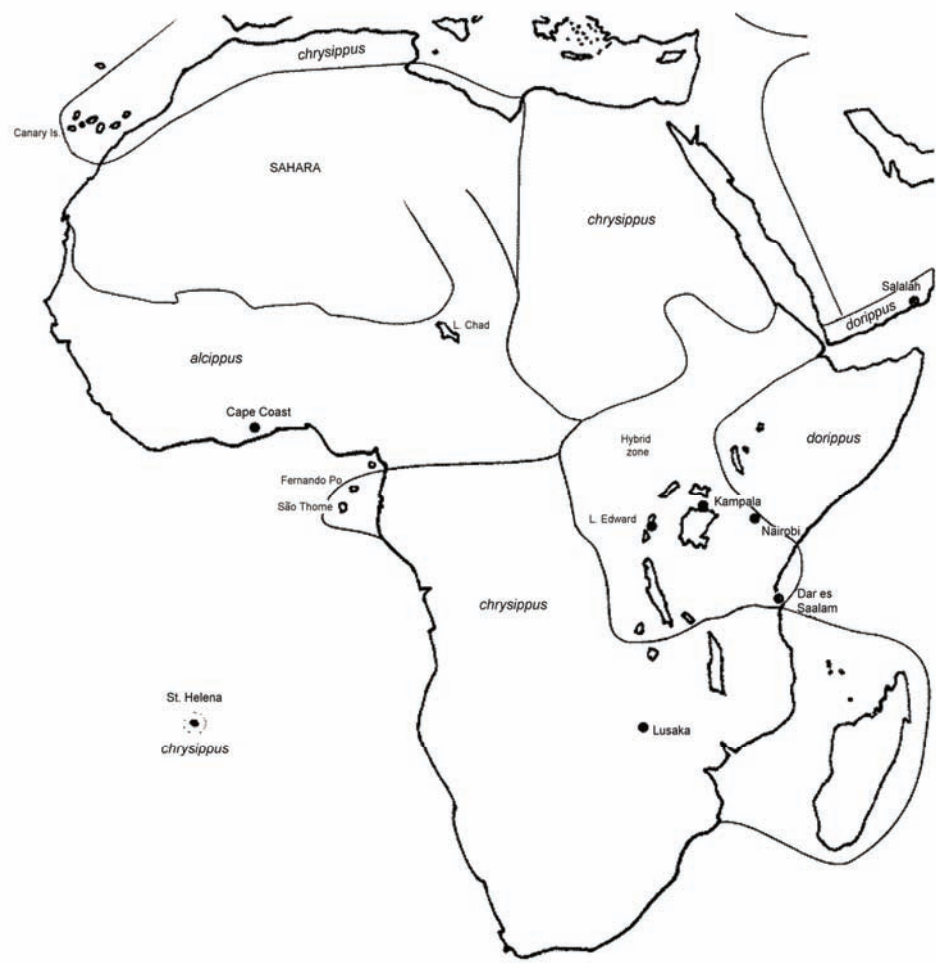
Figure 2. The geographical distribution of the subspecies of D. chrysippus in the Afrotropical region, showing approximate boundaries of the hybrid zone.

migration (Brower, 1977; Vane-Wright, 1993). The difference is that D. chrysippus would complete the annual ‘turn-around trip’ over approximately 12 successive, overlapping