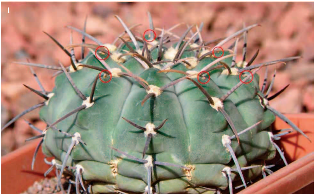
1 General view of the specimen of Gymnocalycium vatteri : the secondary spines (marked with red circles) appear below one-year-old areoles, but are absent at younger ones.

* Instituto de Ciencias Nucleares, Universidad Nacional Autónoma de México, Circuito Exterior C.U., 04510 México, D.F., Mexico Phone: (52) 55 56 22 47 39, ext. 2224 Fax: (52) 55 56 22 46 93 E-mail: basiuk@nucleares.unam.mx