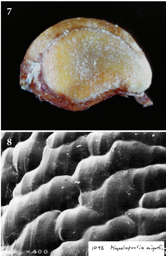
7 Miquelopuntia miquelii FK 48-A, near Totoral at 50 m. The seed is without remnants of pulp, and the funicular girdle is clearly visible. 8 Miquelopuntia miquelii FK 1098, showing the seed surface SEM after removal of the funicular envelope. Use of chemical etching reveals elongated cells with a high domed periclinal wall. Seeds from the southern populations have almost identical seed wall cell characteristics. 9 Distribution map of Miquelopuntia .

Fruit ovoid to oblong in outline nearly white; umbilicus truncate.