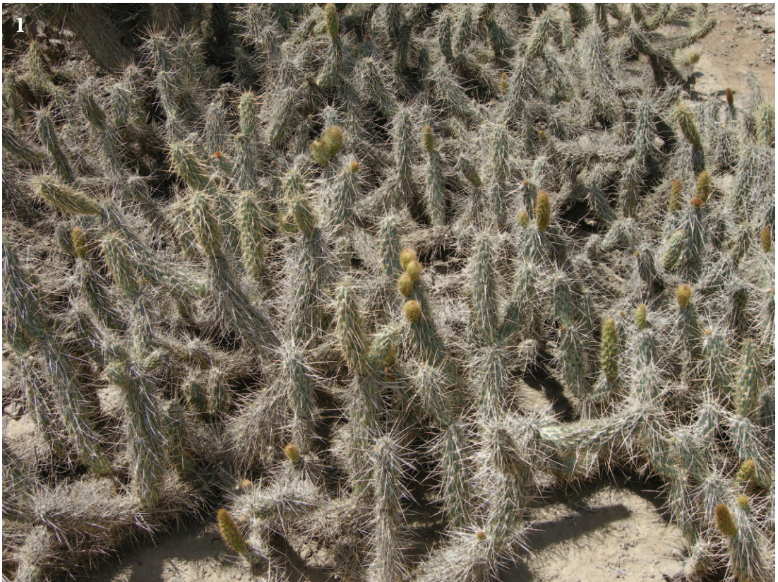
1 Miquelopuntia miquelii FK 1230 Marquesa Canyon, at 430 m.

Growing in colonies 2 to 5 meters broad; stems cylindric, much branched, usually less than 1 meter high, but occasionally 1,5 meters