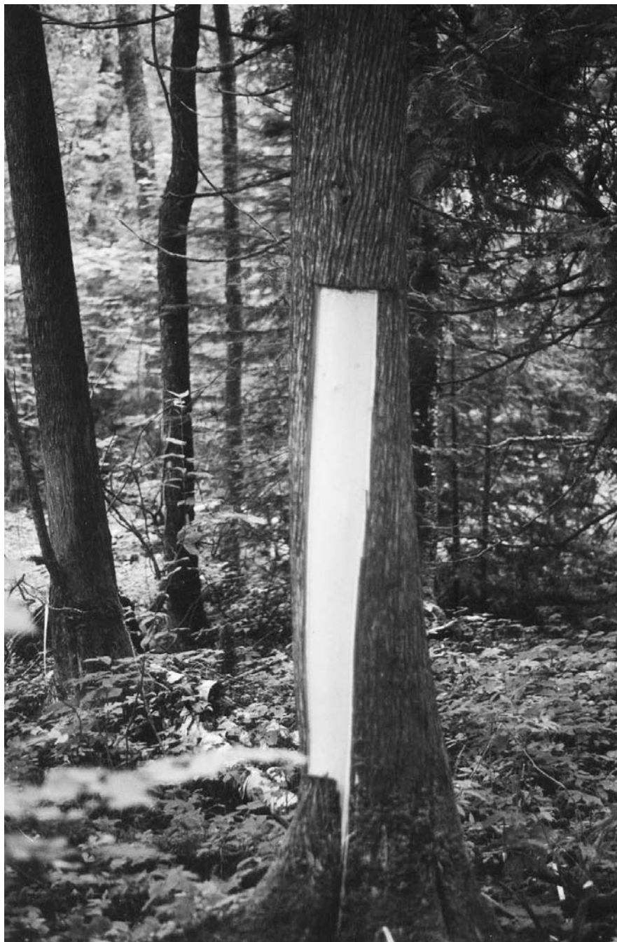
FIGURE 3.—Proper way to harvest cedar ( Thuja occidentalis ) so that the tree will survive.