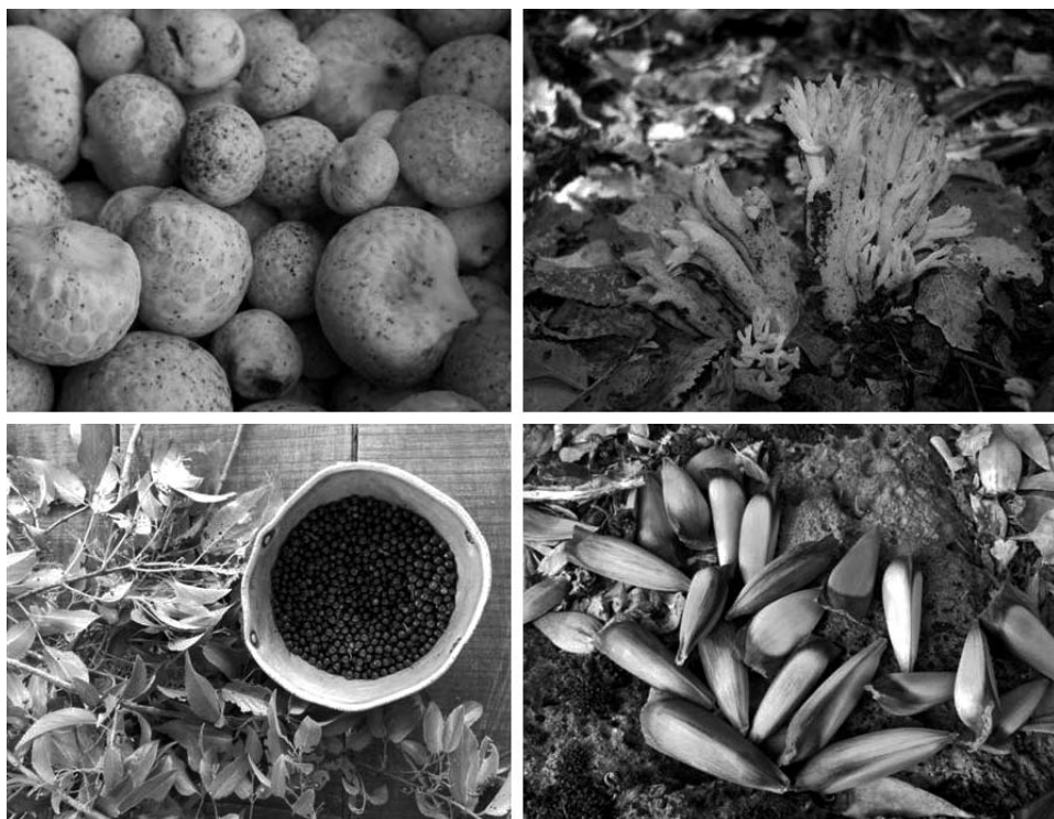
Figure 1. Most salient wild edible plants according to Smith's Saliency Index. From left to right and top to bottom: digüeñe , changle , maqui , and piñones .

cohesion and knowledge transmission (Herrmann 2006). Although people in the community do not strictly depend on the piñon anymore, families always make the effort to have piñones . Whenever someone in the extended family comes back from piñoneando (the act of gathering piñones ), it is customary to share the harvest with kin. This is especially true with elders, as they are most eager to eat wild foods. As one elder expressed, while he peeled and savored some boiled piñones that his son had brought him from the mountains, "When I taste them, I feel that I am back in the mountains."