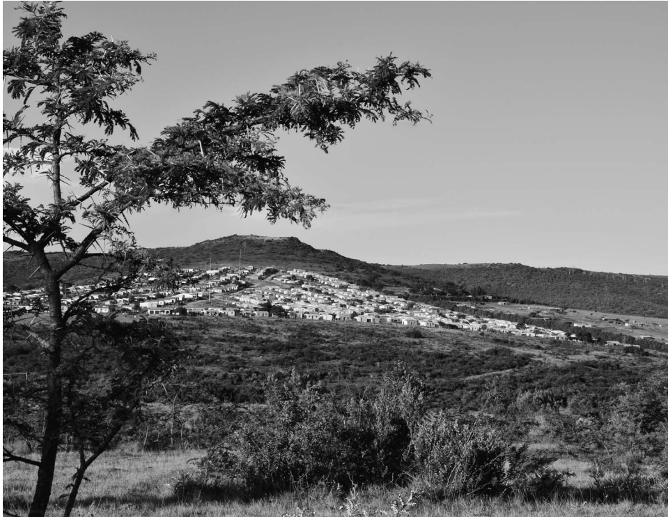
Figure 3. New RDP settlement and municipal commonage. In the distance patches of thicket ( ihlathi ) are accessed.

The Grahamstown municipal commonage covers approximately 9083 ha of land immediately surrounding the city (Puttick 2008). About half of this is made up of “old” commonage, which has been owned by the Grahamstown municipality since the establishment of the town in the early 1800s. The other half is “new” commonage, which consists of previously white-owned commercial farms that have been incorporated into the commonage as part of the government’s land redistribution program. This commonage comprises a mosaic of vegetation types, including grassland, small fragments of Afromontane forest, and variants of subtropical thicket, some of which form dense stands of tall trees with a forest-like appearance. Vegetation to the north and east remains relatively natural and recognizable despite overgrazing and other forms of environmental degradation (Figure 3).