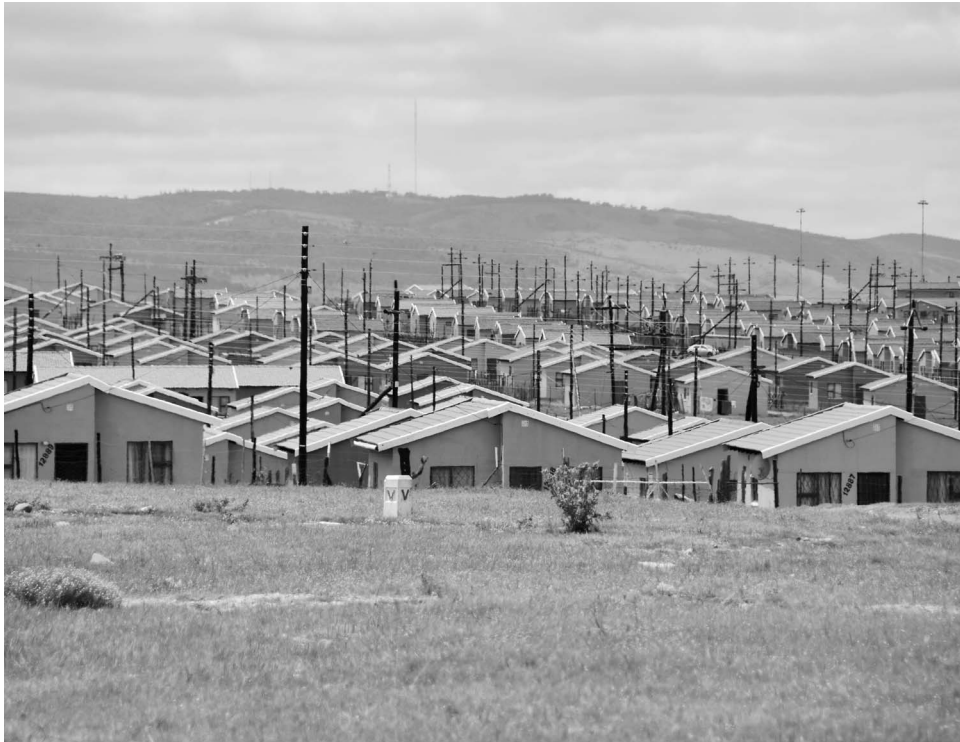
Figure 1. Example of an RDP housing settlement (Photo credit Tony Dold).

supplement their income and to enhance household food security” in urban areas (Department of Land Affairs 1997).