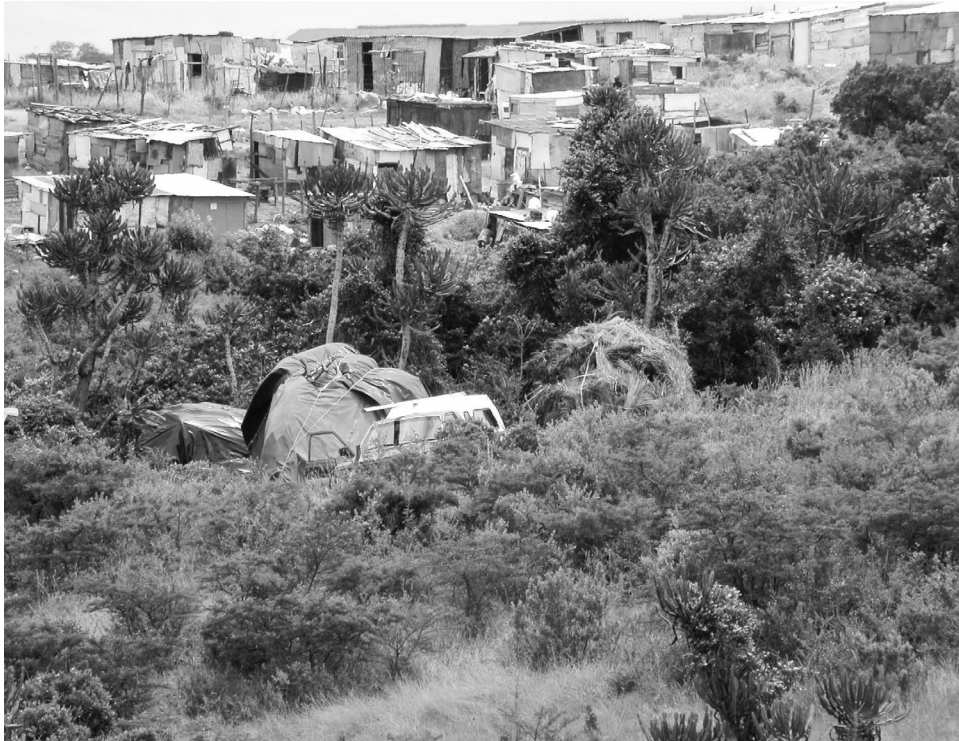
Figure 4. Initiation huts located on municipal commonages.

available spaces. These may not provide the conditions considered ideal, such as a secluded piece of forest, nearby running water, and abundant animal and bird life. Despite all of these changes, initiation sites remain a presence near many townships (Figure 4). Many male respondents in the survey (30%) considered their time spent “in the bush” during initiation as the best period of their lives and their initiation sites retain importance to them for the rest of their lives.