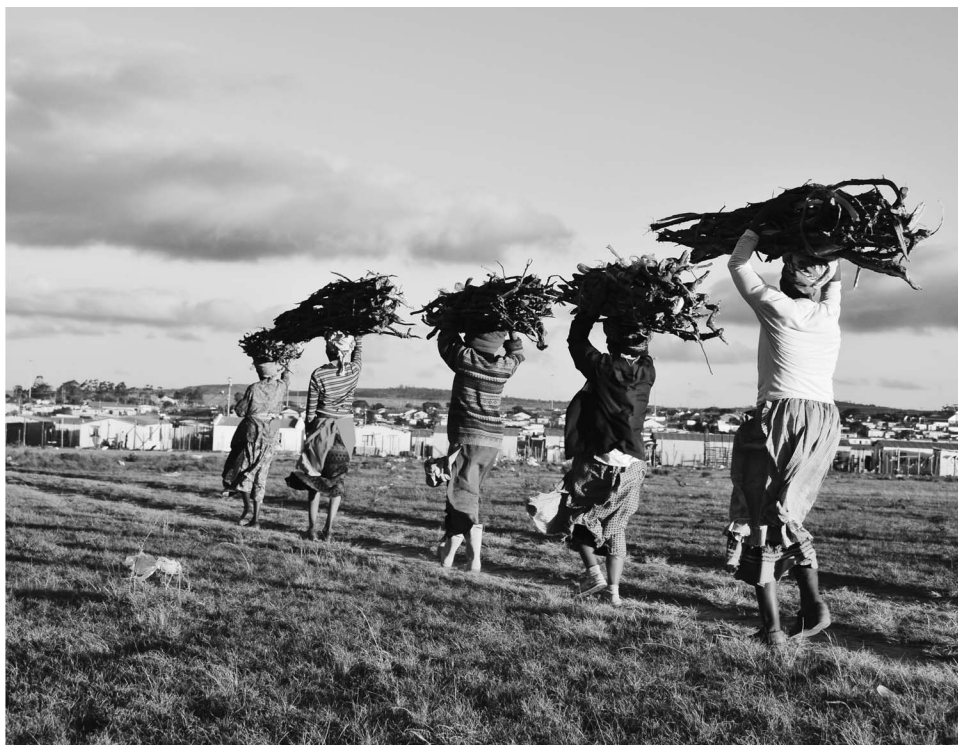
Figure 5. Women collecting bundles of firewood from the commonage.

I cannot go to cut firewood. We want to go there, but because of today, the boys [young men who have not yet been initiated] could rape us if we go to the forest. We are not safe unless we are inside our houses. We are here, and there is no other place to go. We are not safe in this community...I used to collect wood in my youth...It is not possible to go to cut wood now. Someone will rape and kill you. You cannot go to the places you want to in the forest now, someone will kill you. It's not the government that is stopping us. It is because of these people that will kill others now. It is not safe.