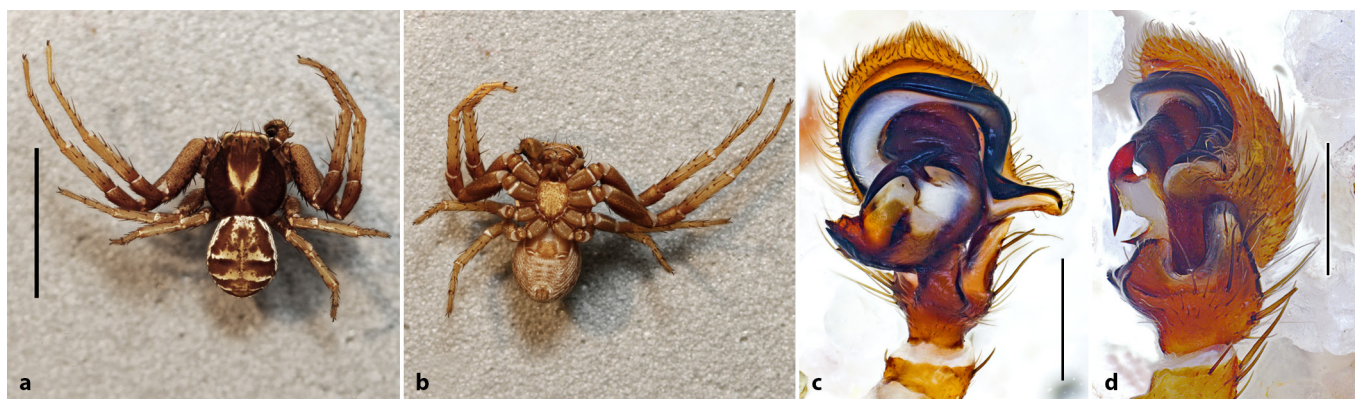
Fig. 2: Xysticus brevidentatus , male from Bosnia and Herzegovina. a. habitus dorsal view; b. habitus ventral view; c. pedipalp ventral view; d. pedipalp retrolateral view; scales: a, b = 5 mm, c, d = 0.5 mm

Based on the distribution reported in the literature, an occurrence of X. brevidentatus in Bosnia and Herzegovina was