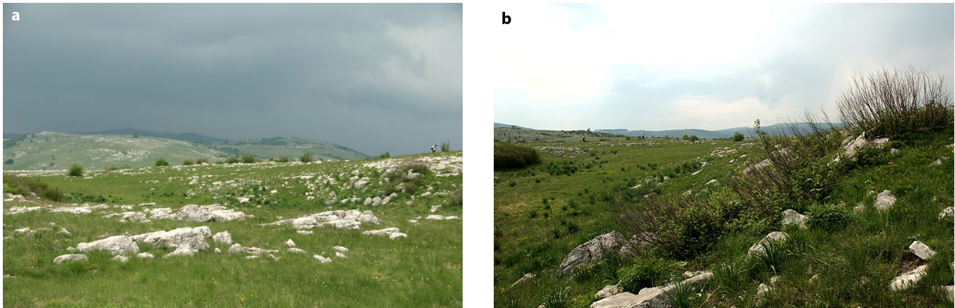
Fig. 3: Locality of Xysticus brevidentatus in Bosnia and Herzegovina. a. grassland near Galečić; b. male and female were collected by sweep netting on low bushes.

to be expected. One of the records in Deltšev et al. (2011) was found at an altitude over 2000 m, which represents the highest known location of the species. The single record in Southern Italy (Aspromonte, Jantscher 2003), collected in 1906 by the well-known Austrian entomologist Gustav Paganetti-Hummeler (OEBL 2020), represents the only specimen known from outside the Balkan Peninsula, and the species has not been collected in Italy again since then. We only found X. macedonicus in the Aspromonte massif, and Jantscher already mentioned that the single male specimen of (supposedly) X. brevidentatus from the Aspromonte massif differs in having an unusual short embolus and tutaculum. Xysticus macedonicus , a very similar and much more widespread species, was recently found in several mountainous regions in Italy outside the European Alps (IJland & van Helsdingen 2019, and our material). Although we were not able to examine the single record of X. brevidentatus from Italy, our material, the findings of IJland & van Helsdingen (2019) and the original remarks of Jantscher raise doubts about the correct determination of the specimen. Jantscher examined several specimens