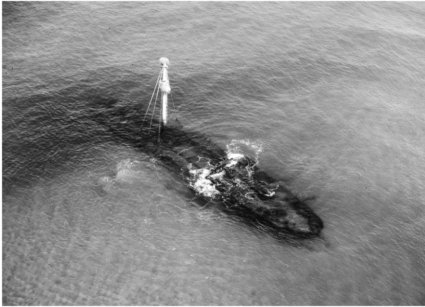
Figure 1. Osprey nest on the mast of a sunken boat, southern Baja California, 27 March 1977.

2000) are worth publishing. Our emphasis is on providing photographic documentation of some of the most unlikely records.