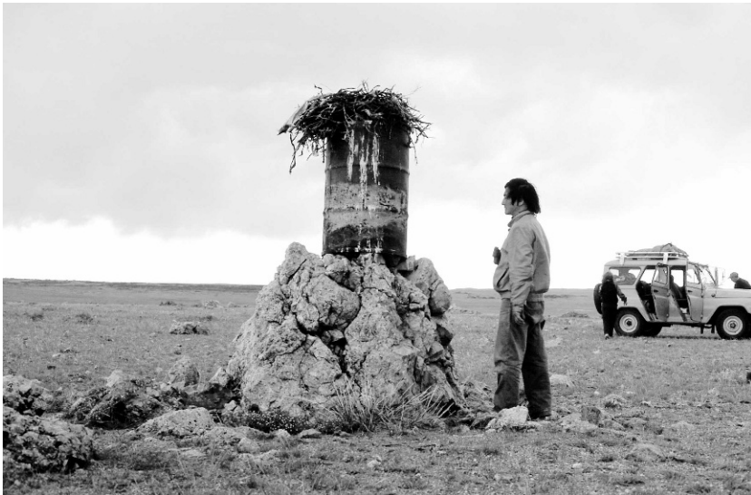
Figure 6. Upland Buzzard nest atop a metal barrel, southeastern Mongolia, 7 June 1998. D. Batdelger is pictured.

Although Prairie Falcons ( F. mexicanus ) nest almost exclusively on cliffs (Steenhof 1998), we have one record of nesting on a building. Following two