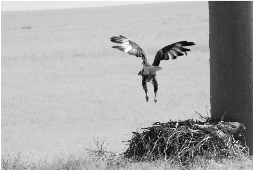
Figure 5. Many Upland Buzzard nests, especially in eastern Mongolia, are placed on the ground next to power or telephone poles. Where poles have sufficient arms and wires to support a nest, ground nests are seldom encountered (May 2008).

100 m of an active fossil fuel pumping station southwest of Powder River, Wyoming.