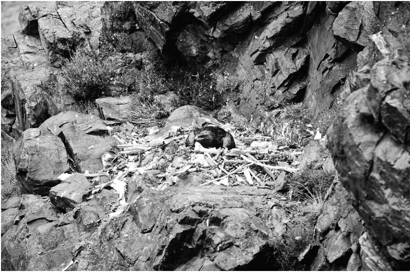
Figure 23. Steppe Eagle nest in northwestern Mongolia composed primarily of bones of large mammals, 25 June 1994.

mented by Grubb and Eakle (1987) for 12 Golden Eagle nests in Arizona.