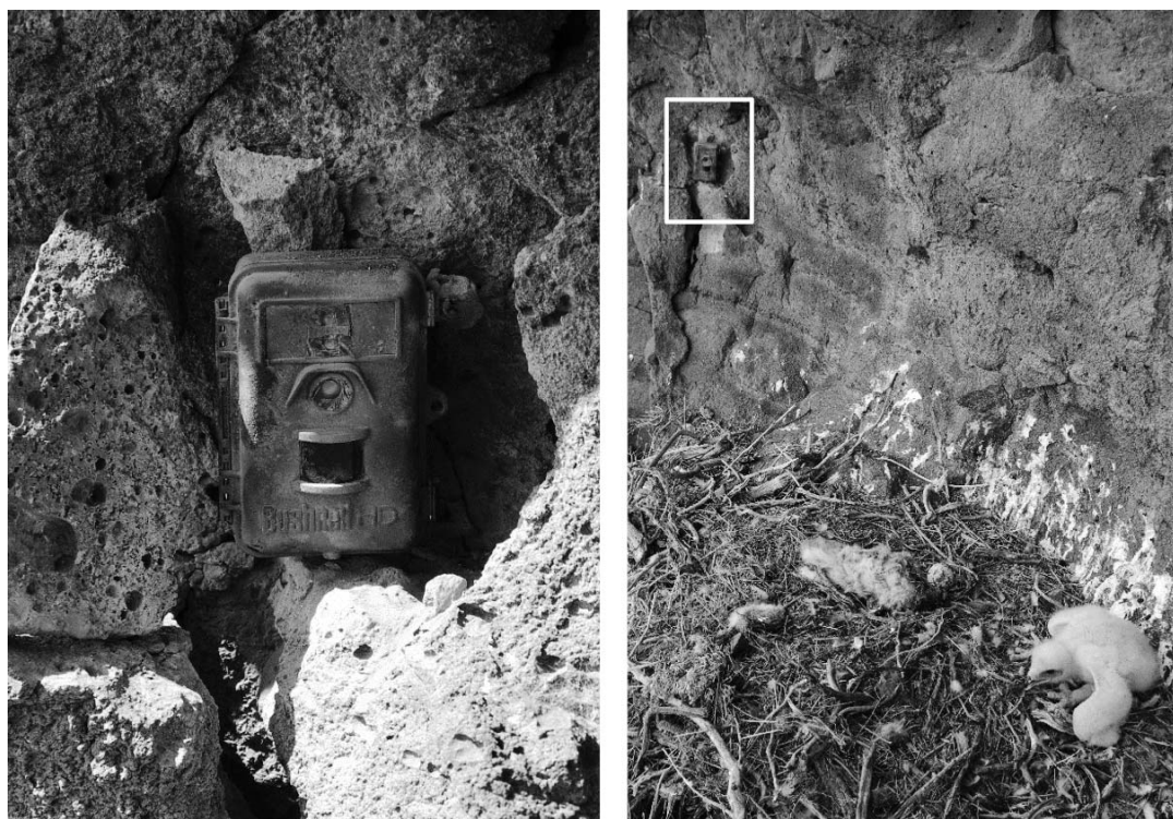
Figure 1. Image of a motion-activated camera installed to monitor Golden Eagle diet and productivity. The camera is concealed in a rocky crevice (left) and is flush against the cliff at a distance of >2 m from the nest (right, camera is highlighted by white box).

was no evidence of adults returning to the nest, we removed the cameras.