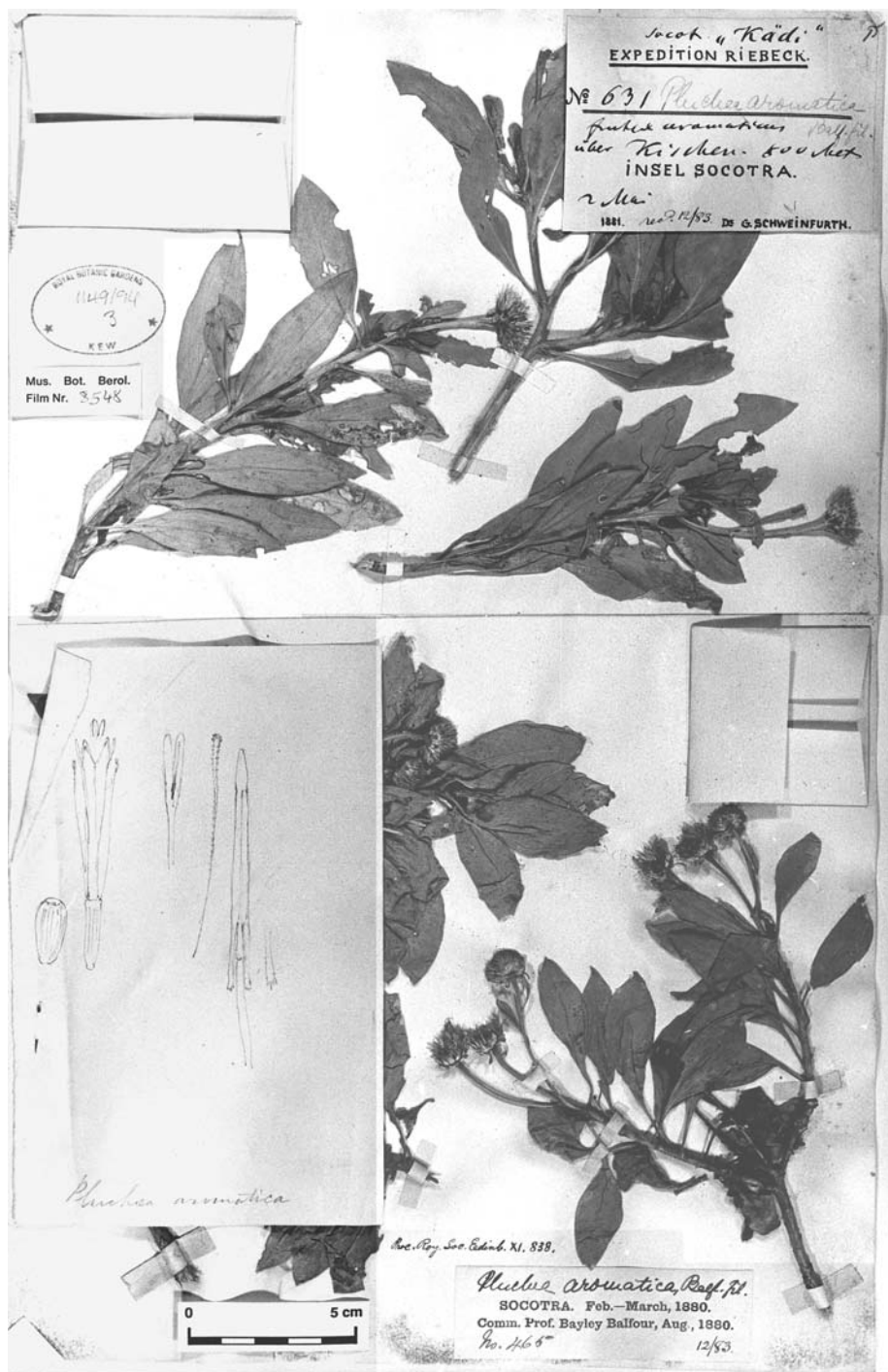
Fig. 1. Pulicaria aromatica – type sheet at Kew, with the lectotype Balfour 465 and the paralectotype Schweinfurth 631.