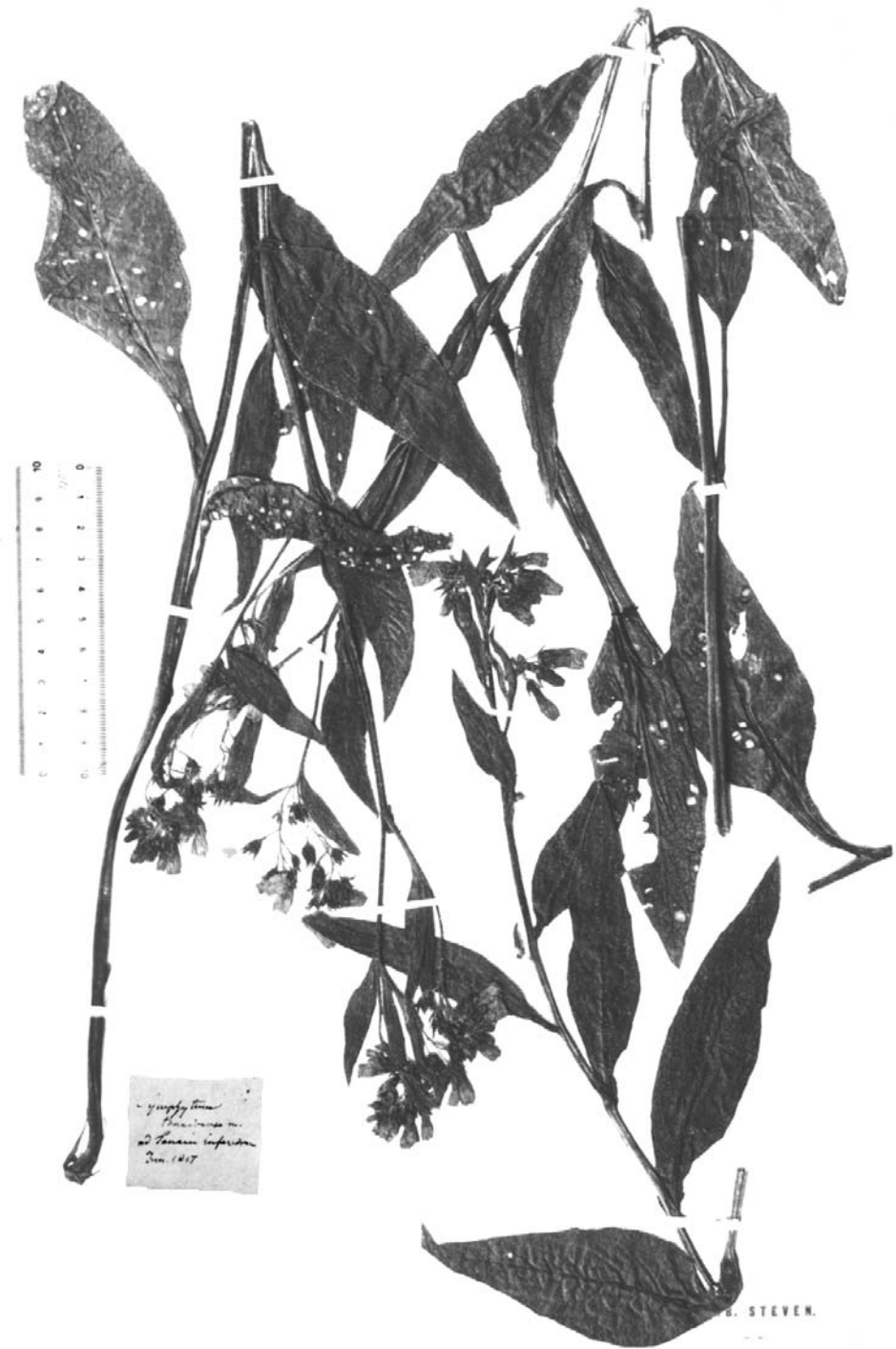
Fig. 4. Symphytum tanaicense – type specimen at the Botanical Museum, University of Helsinki (H).