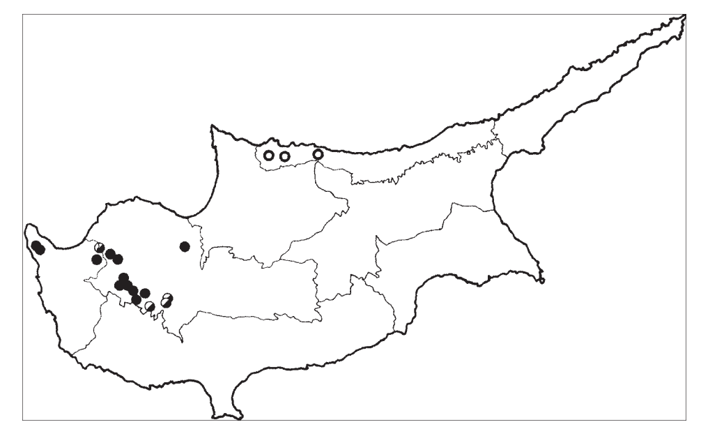
Fig. 2. Distribution of Phlomis cypria according to records by Alziar 2000, Meikle 1985 and in the text. – Circles: subsp. cypria ; dots: subsp. occidentalis ; half dots refer to observations of the latter by Tsintides 1998 and Tsintides & al. 2002. Border lines of the phytogeographical divisions following Meikle (1977, 1985).

≡ Phlomis cypria var. occidentalis Meikle in Ann. Musei Goulandris 6: 93. 1983.