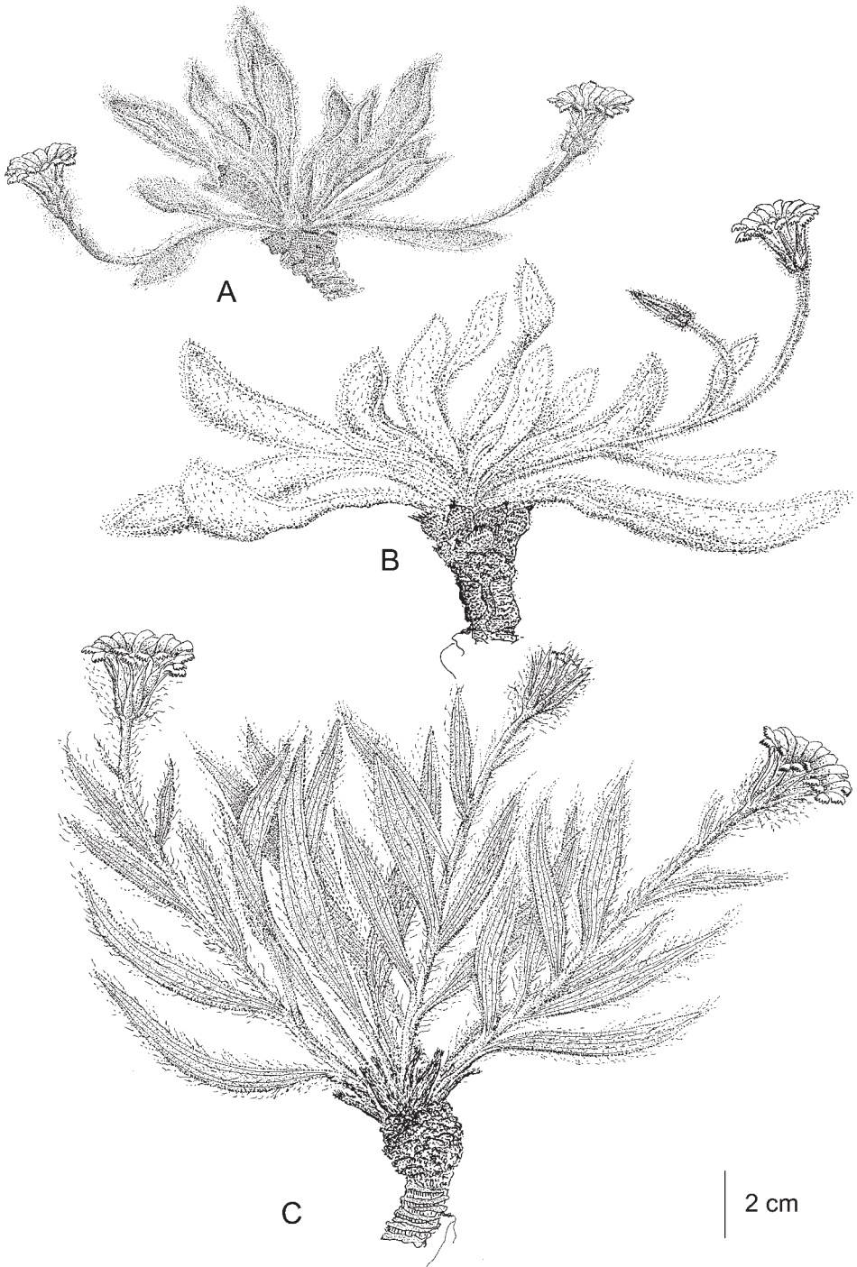
Fig. 2. Scorzonera karabelensis (A), S. ulrichii (B), S. pisidica (C) . – A after R. Ulrich 3/7b, B after R. Ulrich 2/12, C after R. Ulrich 2/22; drawings by Alexander Ehler (BGBM).