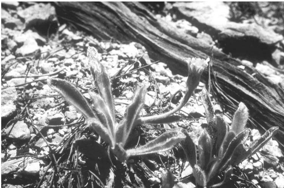
Fig. 1. Scorzonera karabelensis – photograph, from the type locality, by R. Ulrich, 2003.

Holotype: Turkey, C2 Muğla: Fethiye - Korkuteli road, below Karabel Geçidi NE Kemer, 1040 m, steep, gravely, rocky slope, open Pinus nigra var. caramanica forest, N-exp., limestone, 20.5.2003, R. Ulrich 3/7a (B; isotypes: E, ISTE, herb. Parolly). – Fig. 1-2A.