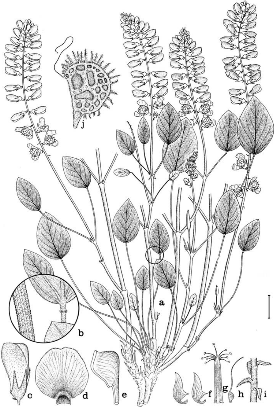
Fig. 1. Onobrychis aurea – a: habit; b: leaf (abaxial and adaxial views); c: flower; d: standard; e: keel; f: wings; g: androecium; h: pistil; i: bracts; j: fruit. – Scale bar for a = 2 cm, b-i = 0.5 cm, j = 0.3 cm.