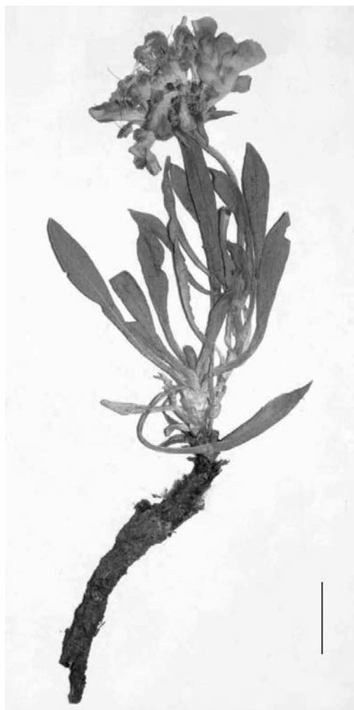
Fig. 1. Lomelosia solymica – specimen Ulrich 4/24a (herb. Parolly). – Scale bar = 1 cm.

(10-)15-35(-40) × 2-6 mm, narrowly obovate to spatulate or oblanceolate, tapering into a narrow base, apex mostly acute, less often mucronulate to obtuse. Stem leaves similar, but smaller in size than rosette leaves, very few, often reduced to bracts. Peduncle 1-2 cm long, c. 0.7 mm in diam., leafless. Capitula solitary, in flower flattened-hemispherical, radiant, (15-)20-25(-30) mm in diam., in fruit globose, 12-17 mm in diam. Involucral bracts 8, in two series, distinctly (3-)5-7-veined outside, variable in shape and density of the indumentum, outer surface thinly to densely pubescent, inner surface often glabrous; outermost bracts green, mainly with paler centres and purplish margins, ovate to ovate-lanceolate, often gibbous in the middle, 4-6 × 2-3 mm, apex apiculate to obtuse; innermost bracts similar but smaller in size, gradually merging into the receptacular bracts. Receptacular bracts white, with purplish or green tips, scale-like, keeled, oblanceolate to narrowly ovate, 3-5 × 1.2-2 mm, herbaceous with a hyaline membranous margin clearly dilated towards the base or only with herbaceous tip and vein, apex ± rounded, hairs as in involucral bracts but thinner. Florets 14-20, pale mauve, lilac to pinkish, the outer strongly radiant, 11-13 mm long. Corolla with a narrowly infundibuliform, white-lanate tube, c. 4.5-7 mm