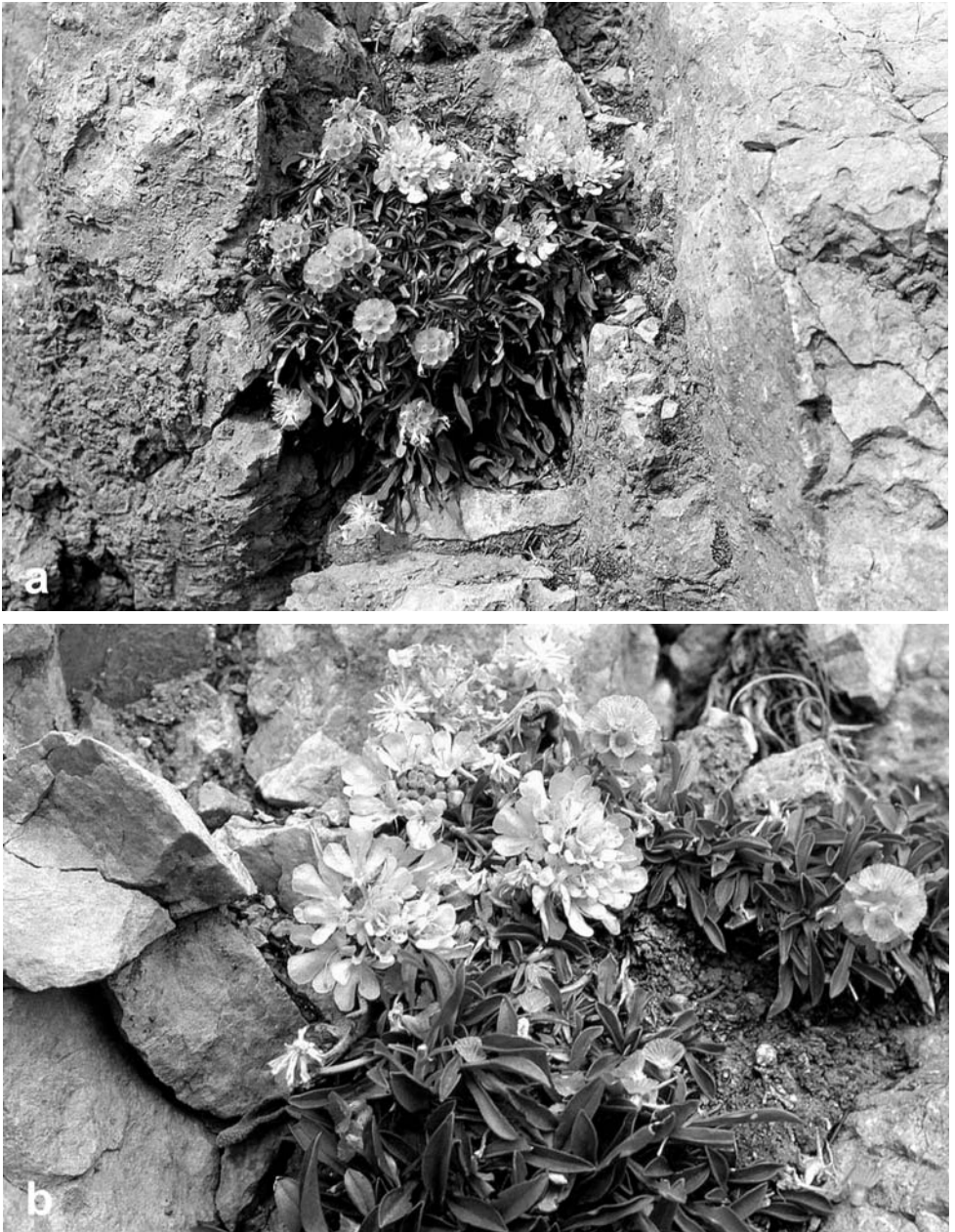
Fig. 2a-b. Lomelosia solymica in its natural habitat [Turkey, C3 Antalya, Tahtalı D.]; note the dispersed fruits in b.

long and with (4-)5 very unequal lobes, outside loosely lanate-pubescent, inside with scattered stalked glands; lobes of the 3 lower segments elliptic, obovate to narrowly ovate, 4.5-5.5 × 3-4 mm, the 2 upper broadly obovate, 2-2.5 × 2-2.5 mm. Stamens 4(-5), long exserted; filaments whitish to rarely pale purplish in upper part, 6-12 mm long, flattened, winged; anthers pale pinkish Downloaded From: https://complete.bioone.org/journals/Willdenowia on 23 Apr 2024 Terms of Use: https://complete.bioone.org/terms-of-use