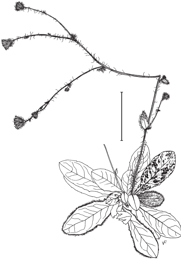
Fig. 1. Hieracium greuteri . – Scale bar = 5 cm; spots and indumentum of the basal leaves exemplarily shown; drawn after the holotype by Felicitas Velten.

Holotypus: Greece, Peloponnisos, Nom. Achaia, Chelmos, 2.5 km SW Solos, oberes Flusstal des Krathis-Potamos, Aufstieg zur Styx-Schlucht, 1200–1500 m, 29.6.2002, L. Meierott 02GR319 (B; isotypi: UPA, herb. Gottschlich No. 45139) – Fig. 1.