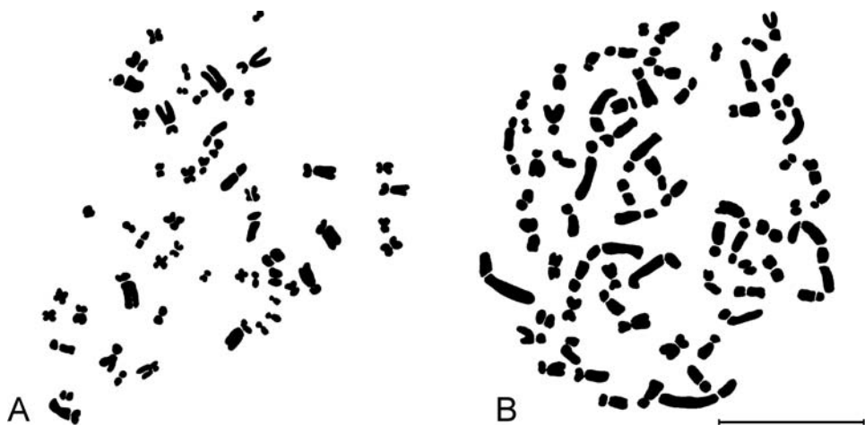
Fig. 2. Mitotic metaphase plates of Limonium narbonense – A: 2n = 6x = 54 , material from Magnisia, Chrisi Akti Panagias (Georgakopoulou & Manousou 214a); B: 2n = 8x = 72 (Georgakopoulos & Manousou 214). – Scale bar = 10 \mu\text{m} .

The populations of Limonium narbonense were found to be hexaploid with 2n = 6x = 54 and octaploid with 2n = 8x = 72 (Table 1, Fig. 2). The chromosome number 2n = 6x = 54 has also been counted for the closely related Greek endemic L. brevipetiolatum (Artelari & Erben 1986) as well as for the European relative L. humile Mill. (Erben 1979). L. narbonense was known so far as tetraploid with 2n = 36 from Greece (Artelari 1992) and as diploid with 2n = 18 and as tetraploid from the wider Mediterranean region (Baker 1953c, Erben 1978, 1979, 1993, Brullo & Pavone 1981, Palacios & al. 2000). Both hexaploid and octaploid karyotypes lack the ‘marker’ chromosomes (Fig. 2) and this is also the case in the karyotype with 2n = 36 (Erben 1978, Artelari 1992). As is shown in Table 1, at the locality “Chrisi Akti Panagias” both chromosome numbers 2n = 54 and 72 were counted. In this place, individuals with 2n = 72 were found in the exterior side of the bay, exposed to wind and waves and it seems that their high ploidy level is a response to the extreme ecological conditions. These plants are more robust and advanced in flowering than those with 2n = 54 , but the detailed study of their morphological characters did not show any other significant difference. The octaploid number 2n = 72 is the highest reported so far for the genus Limonium .