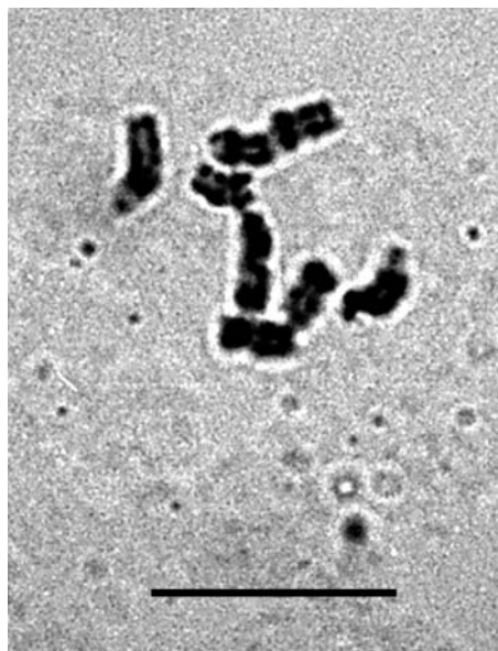
Fig. 4. Viola dirimliensis , metaphases of root-tip mitoses, 2n = 8 (from Eren & Şirin 473). – Scale bar = 10 \mu m.

C2 ANTALYA: Between Korkuteli and Fethiye, Kayabaşı, ascent from Kayabaşı village to summit of Ziyaret T., 1520 m, barren serpentine rock, 22.4.2002, Eren & Şirin 4738 (AKDU, B, herb. Parolly); ibid. , 9.1.2005, cult. material of Eren & Şirin 4738 (herb. Parolly); ibid. , 1500 m, 12.5.2003, Eren 57/03 & Şirin (fruiting, AKDU); between Söğüt and Bekçiler, barren serpentine rock, 1270 m, 8.5.2004, Eren 22/04 & Şirin (AKDU); between Söğüt and Acıpayam, barren serpentine rock, c. 1250 m, 30.4.2005, Eren (photograph).