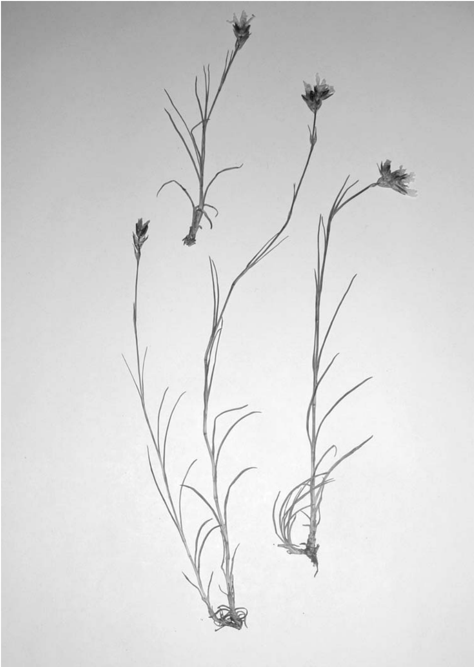
Fig. 2. Arenaria dianthoides subsp. tuncbasi – isotype at AYDN.