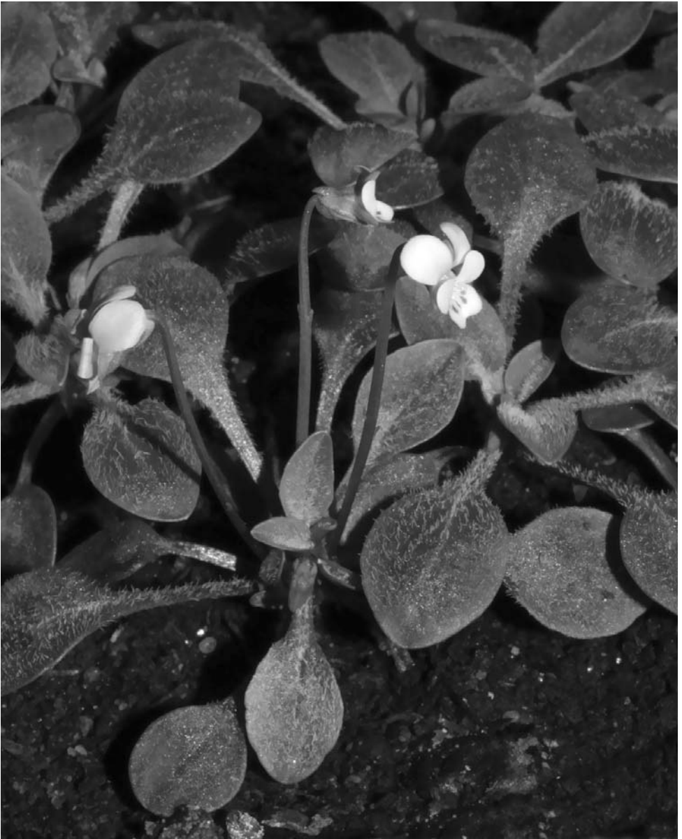
Fig. 3. Viola dirimliensis – cultivated plants raised from Eren & Şirin 4738 (herb. Parolly).

for colour photographs see the electronic supplement). This number is also new for the genus and fills the single gap in the descending aneuploid series from x = 11 to x = 2 in V. sect. Melanium (Erben 1996). V. rauliniana has 2n = 36 (Erben 1985), and thus must be deleted from the flora of Turkey. The Turkish plant can neither be seen as a putative subspecies of V. rauliniana , as was our hypothesis for some time, nor is it close to V. mercurii , endemic to the eastern Peloponnisos, which is clearly distinct from V. dirimliensis in many morphological characters and 2n = 10 , as has V. parvula .