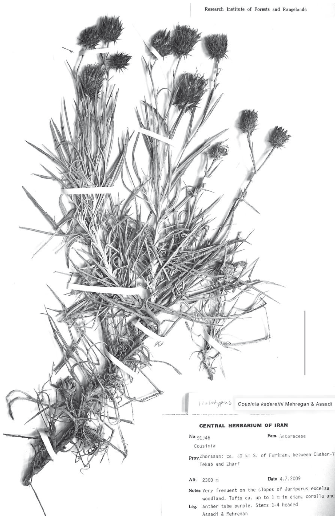
Fig. 3. Holotype of Cousinia kadereitii (Assadi & Mehregan 91946, TARI). – Scale bar = 5 cm.