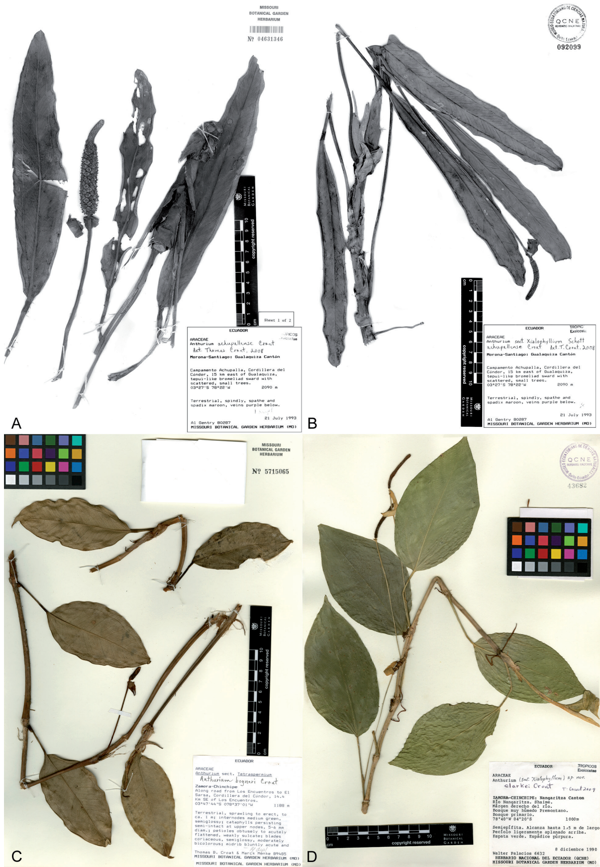
Fig. 1. A–B: Anthurium achupallense – holotype specimen at MO, Gentry 80287 (A), isotype specimen at QCNE (B); C: A. bogneri – holotype specimen at MO, Croat & Menke 89485; D: A. clarkei – isotype specimen at QCNE, Palacios 6632.