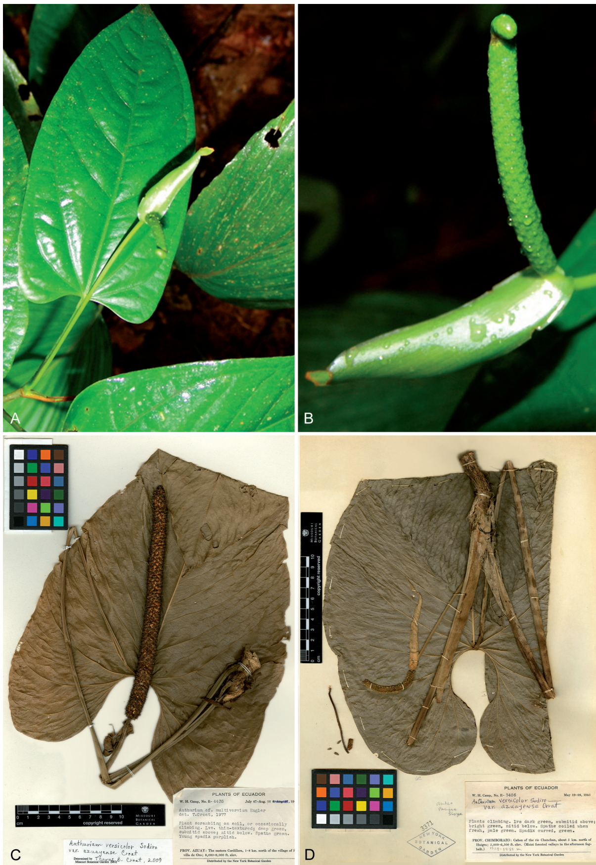
Fig. 3. A–B: Anthurium patens – leaf blade, adaxial surface and inflorescence (A); inflorescence, close-up (B); C–D: A. versicolor var. azuayense – type specimen, Camp E-4435; D: paratype specimen, Camp E-3406.