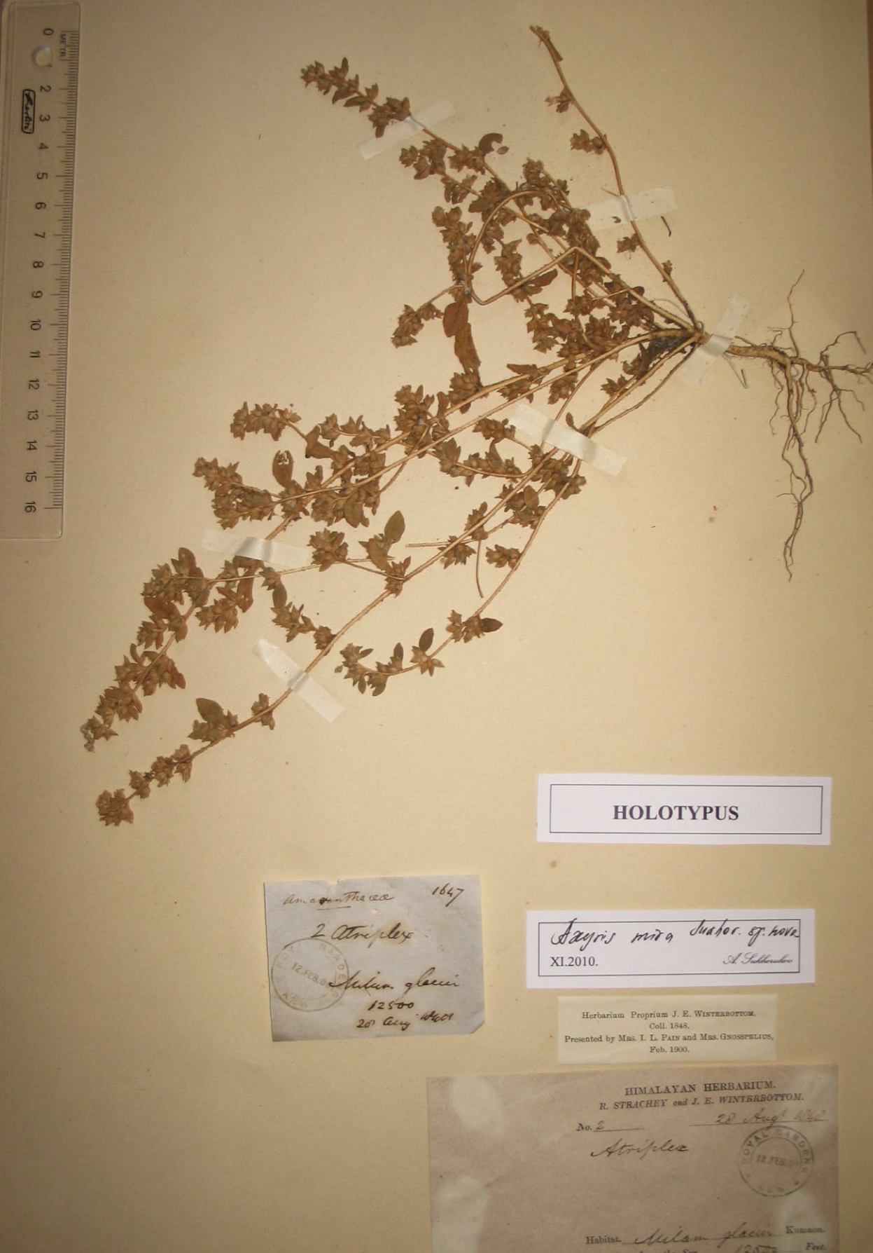
Fig. 1. Axyris mira – holotype specimen at LE. Downloaded From: https://complete.bioone.org/journals/Willdenowia on 18 Apr 2024 Terms of Use: https://complete.bioone.org/terms-of-use