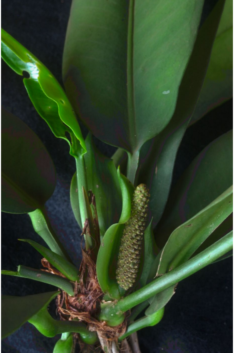
Fig. 1. Anthurium truncatum in cultivation. from the living accession vouchered as Gonçalves 2010.

50–65° angle, arcuate, slightly prominent on upper surface, raised below; secondary veins prominulous in both surfaces when dry, reticulate veins almost invisible to slightly raised below; collective vein 5–6 mm from leaf margin. Inflorescences usually pendent after anthesis, much shorter than the leaves; peduncle 1–2 cm long, 0.5–0.7 cm diam., 2–4 × shorter than the petioles; spathe erect, chartaceous, ovate, semimatte medium green outside, concolorous or a little glaucous inside, densely white-speckled on both surfaces when fresh, 3–5 × 1.5–2.5 cm, broadest near the base, sometimes almost at middle, inserted at 45° angle on the peduncle, cuspidate to acuminate at apex, obtuse at base, spathe margins meeting obtusely to almost at 180°; spadix greenish to greyish green, stipitate for 4–5 mm, tapered, 2.6–4 cm long, 0.6–1 cm diam. at base, 3–5 mm diam. at apex, broadest near base; flowers rhomboidal, 3–3.5 mm long, 2.8–3 mm wide; 7–8 flowers visible in principal spiral, 5–6 flowers visible in alternate spiral; tepals matte, lateral tepals 0.9–1 mm wide, inner margins straight, the outer margins 2-sided; pistils emergent, stigma rounded; stamens not covering the stigma at all, filaments not exerted, anthers 0.5–0.7 × 0.4–0.6 mm, thecae ovoid, 0.5–0.7 × 0.2–0.3 mm. Infructescence unknown.