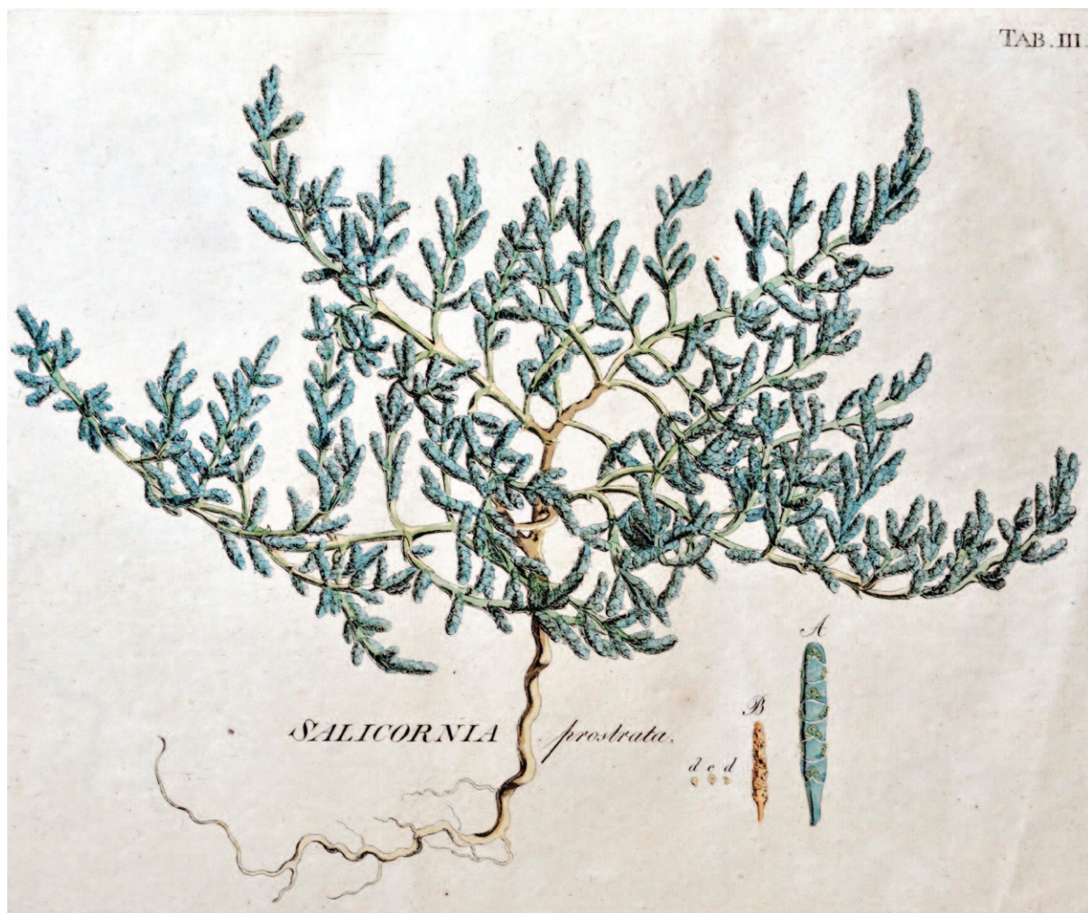
Fig. 2. Illustration of Salicornia prostrata Pall. (Pallas 1803: t. 3).

(1995), Tzvelev (1996) and Sukhorukov (2006) agree that the diploid populations in SE Russia and W Kazakhstan, which generally can be separated from the tetraploids by the smaller anthers (0.25–4 mm), shorter spikes (up to 3–4 cm) and thinner central cylinders (König 1960), belong to one species. It is named Salicornia herbacea , S. europaea , S. prostrata or S. perennans , with the first and the third name being synonyms. Only Pallas (1803) recognised three species, raising his S. herbacea var. \beta to species rank as S. prostrata , re-naming the erect growing plants as S. acetaria and describing the new species S. pygmaea . However, the last species was later recombined as Halopeplis pygmaea (Pall.) Bunge ex Ung.-Sternb. As far as is known to us, Salicornia was never critically studied in the area under review. Therefore, our observations about the variability of Salicornia gained during an expedition also aimed at studying the annual salt-marsh communities of the Caspian lowlands in 1996 (Freitag & al. 2001: 70–71), merit some discussion.