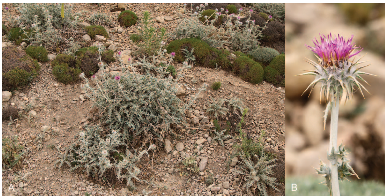
Fig. 2. Cousinia saloukensis at its type locality – A: mature individuals along with young plants; B: flowering head.

Systematic affinities — Morphologically Cousinia saloukensis is most similar to C. polyneura Rech. f. of C. sect. Eriocousinia from eastern Afghanistan. This lat-