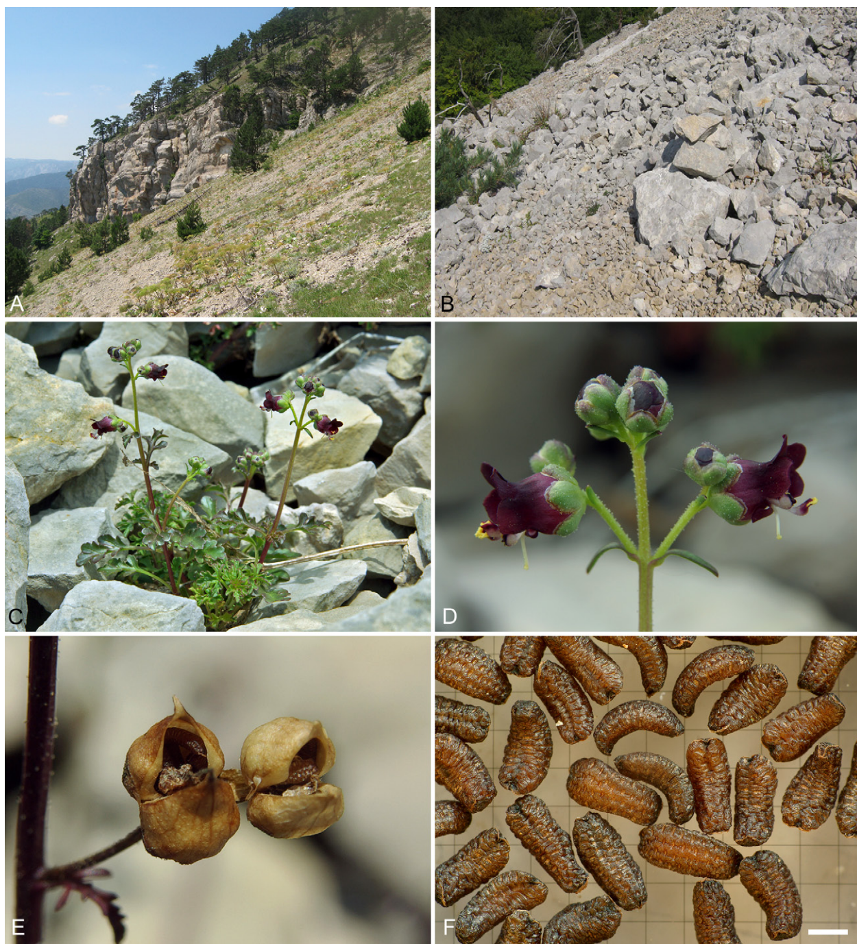
Fig. 1. Scrophularia exilis and its habitats – A: habitat at Djunyn-Kosh; B: habitat at Shagan-Kaya (mobile part of the scree); C: general aspect of a flowering plant; D: flowers and buds; E: capsules; F: seeds. – Scale bar = 1 mm. – Photographs by A. Fateryga (A), A. Nikiforov (B) and S. Svirin (C–F).

In 2012, we were successful in rediscovering Scrophularia exilis in its type locality, as well as in a second locality, and in collecting new material for the first time since the collection of the type specimens in 1929. The purpose of this paper is to give the diagnostic characters of S. exilis according to our new data, to establish its differences from S. heterophylla subsp. laciniata , to ascertain coenotic conformity of the species and to provide an updated key to the species of Scrophularia in the Crimean flora.