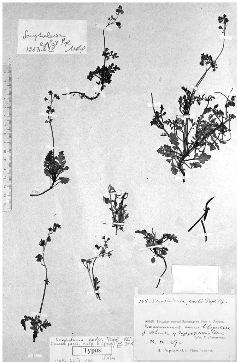
Fig. 2. Holotype of Scrophularia exilis at LE.

on the slope of Mt Shagan-Kaya in the Crimean Nature Reserve, 44°34'44"N, 34°13'36"E, 1345 m, 11 Jun 2012. Both localities were on east-facing rocky scree slopes (Fig. 1A) formed of fragments of Jurassic limestone and divided into relatively stable parts and mobile parts (Fig. 1B). The plants of S. exilis grew only on the mobile parts in three areas (c. 200, 800 and 850 m 2 ) on Mt Djunyn-Kosh and one area (about 2400 m 2 ) on Mt Shagan-Kaya. There were more than 400 individuals on Mt Djunyn-Kosh and more than 700 individuals on Mt Shagan-Kaya.