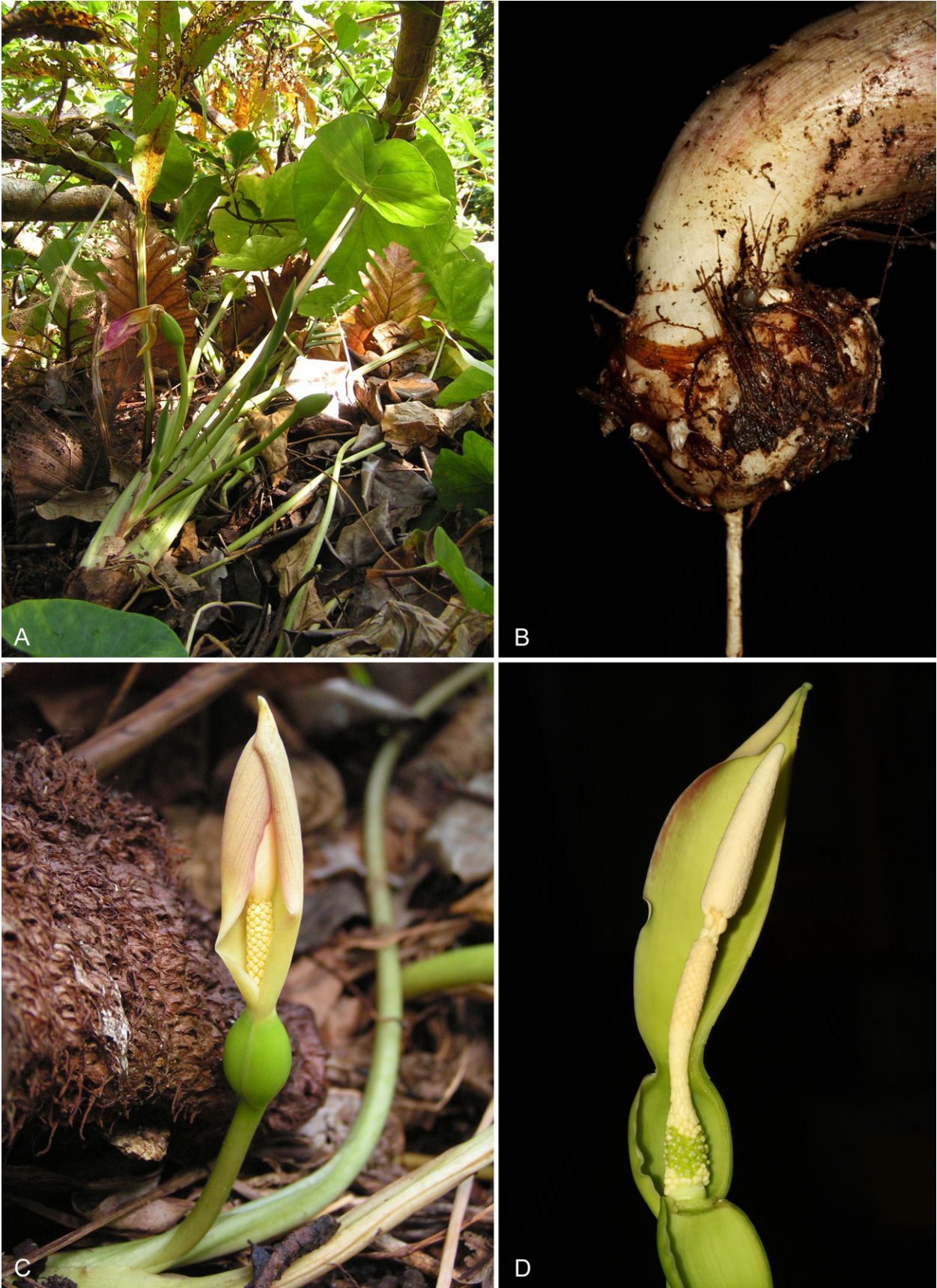
Fig. 2. Alocasia evrardii – A: plant in habitat; B: tuberous stem; C: inflorescence at anthesis; D: young inflorescence with spathe tube opened to show spadix. – Photographs: Vietnam, Binh Thuan province: Takou Nature Reserve area, 2 Oct 2009, H. T. Luu.