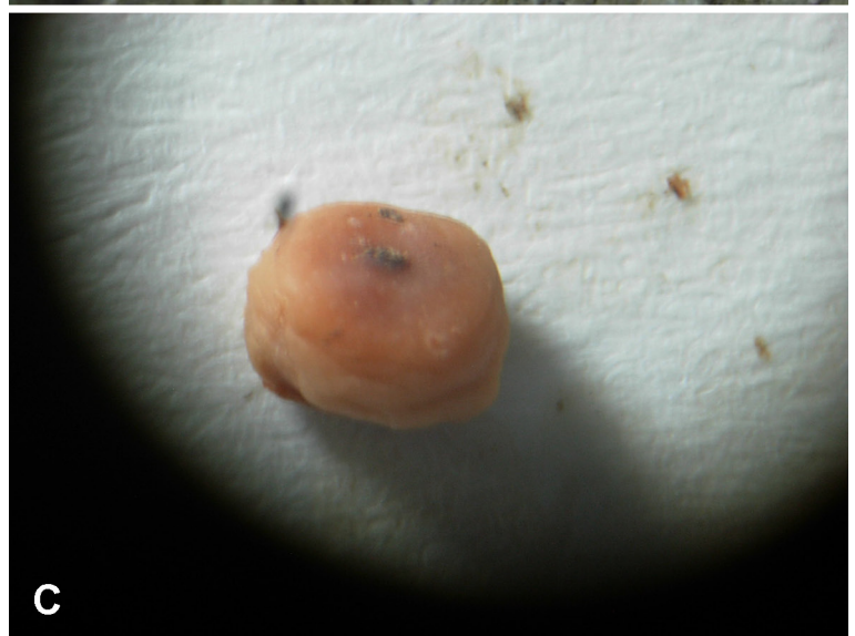
Fig. 4. Anthurium pahumense – A: Live plant, flattened; B: leaf blade, dried, showing glandular punctations; C: berry, mature. from the type gathering, C. E. Cerón & C. I. Reyes 60631.