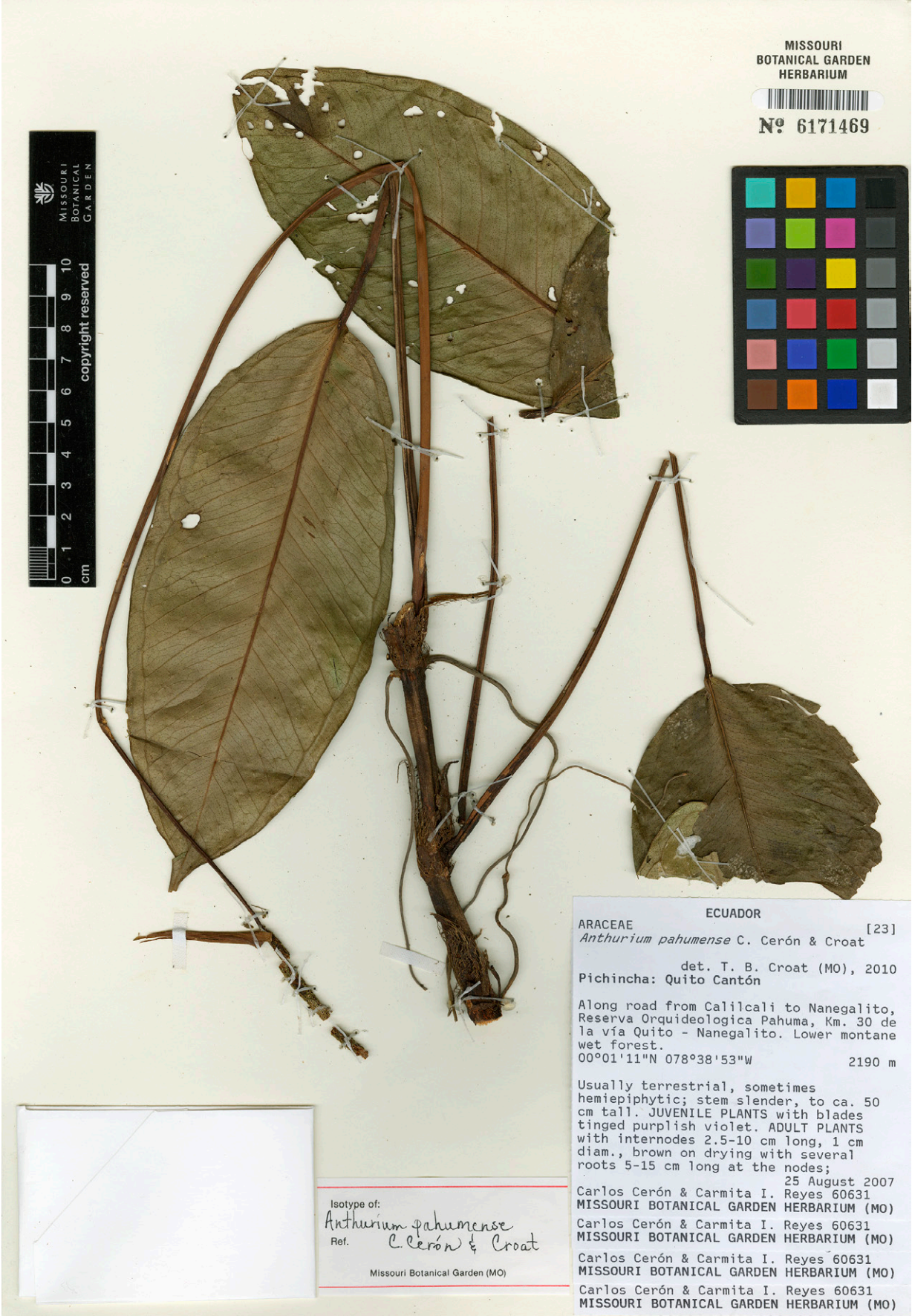
Fig. 3. Anthurium pahumense – isotype specimen (MO 6171469).