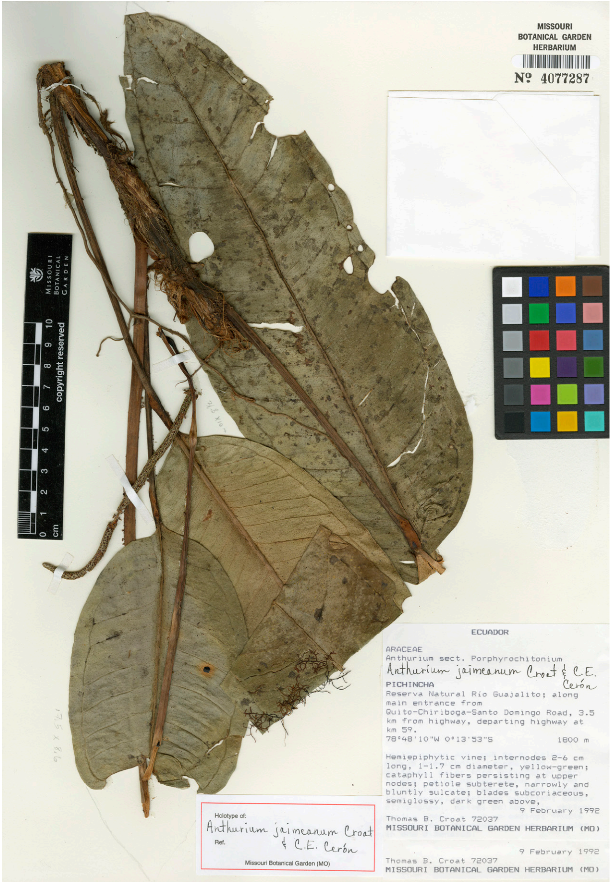
Fig. 1. Anthurium jaimeanum – holotype specimen (MO 4077287).