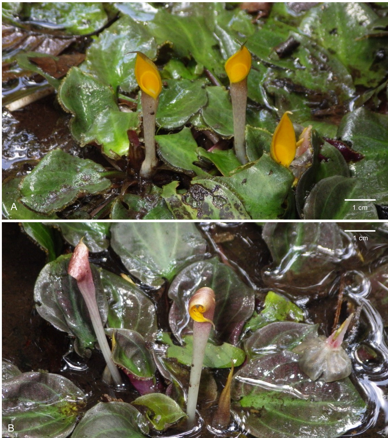
Fig. 3. Cryptocoryne aura , close-up of plants in Fig. 2. – A: newly opened spathes showing subobliquely twisted limb; B: older spathes showing forward-twisted limb. – Photographed on 26 February 2015 by S. Wongso.

Most species of Cryptocoryne have a rather undifferentiated embryo, which pushes through the distal end of the seed (micropylar end), and the root hairs can be seen at the “tip” of the embryo; just behind that, the plumular processes (prophylls) are seen pointing “backwards”. After further growth, more roots and leaves appear. Most of the embryo remains inside the seed, where it serves to absorb the endosperm in order to feed the growing embryo during the initial stages. There are a few exceptions to this simple embryo in