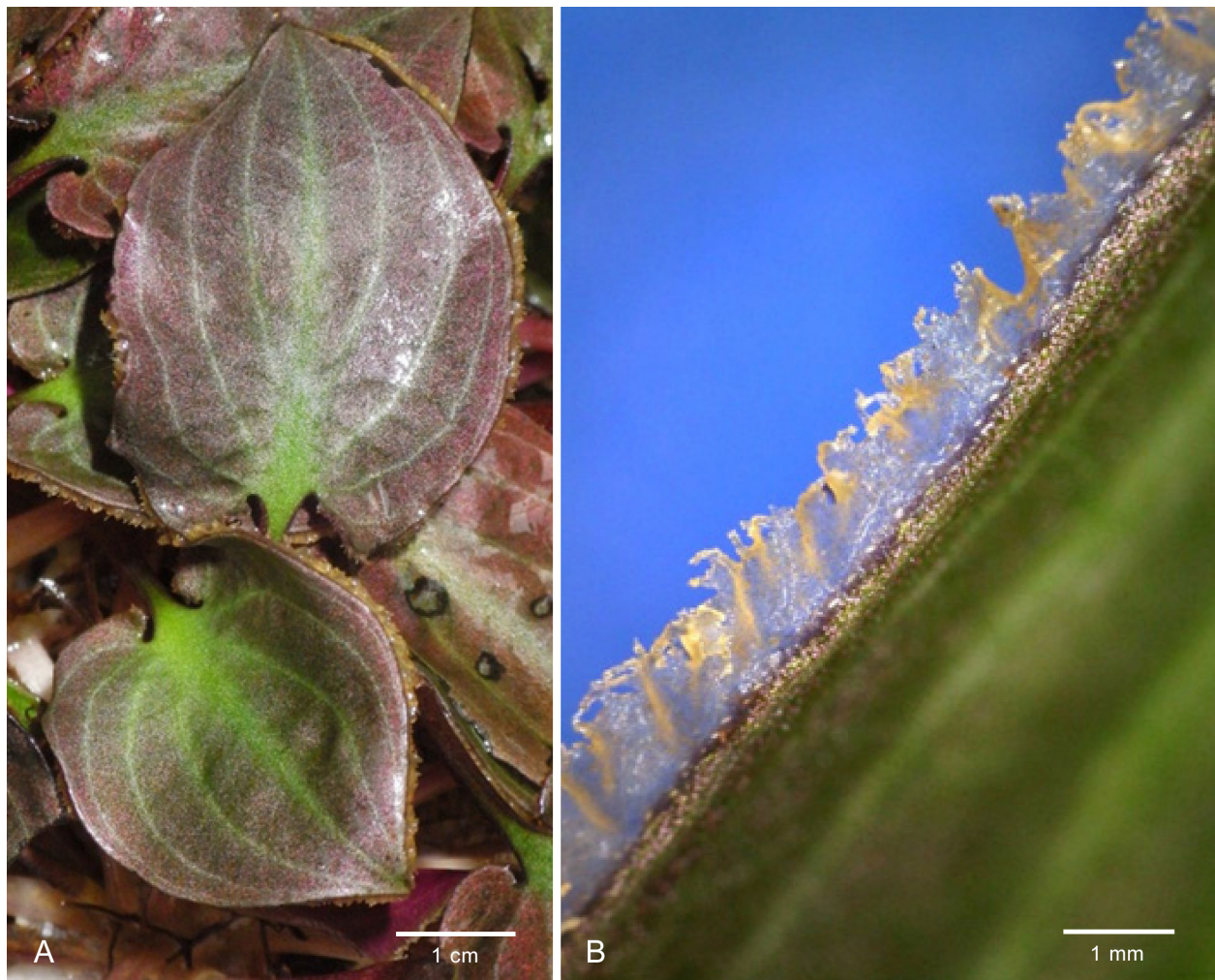
Fig. 4. Cryptocoryne aura – A: leaf showing surface patterns and transparent margin; B: close-up of transparent margin (the “aura”) with ciliate trichomes.

viously been reported for Cryptocoryne , and from this number alone it is not possible to say anything about relationships (Arends & al. 1982). The basal chromosome numbers of x = 10, 11, 15, 17 and 18 have been recorded for Bornean species; x = 10 has been found in the Bornean C. hudoroi Bogner & N. Jacobsen, C. ideii , C. keei N. Jacobsen and C. striolata Engl.; x = 11 has been found in the widespread SE Asian C. ciliata ; and x = 14 has been found in the Sri Lankan group around C. beckettii Thwaites ex Trimen. However, the morphology and the chromosome number together do not provide any clue as to relationships between C. aura and other Cryptocoryne species.