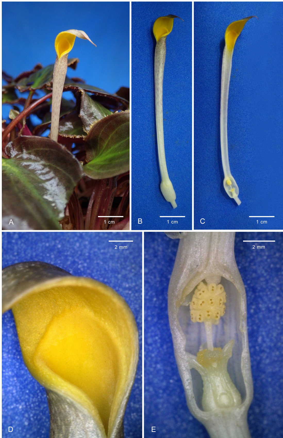
Fig. 5. Cryptocoryne aura – A: plant showing limb of spathe slightly subobliquely twisted (older spathe); B: limb of spathe bent forward at a younger stage than in A; C: spathe longitudinally cut open showing kettle in lower part; D: limb of spathe showing slightly raised collar; E: opened kettle showing female flowers below, olfactory bodies (yellow) above, sterile interstice, and male flowers above. – Photographs by S. Wongso.