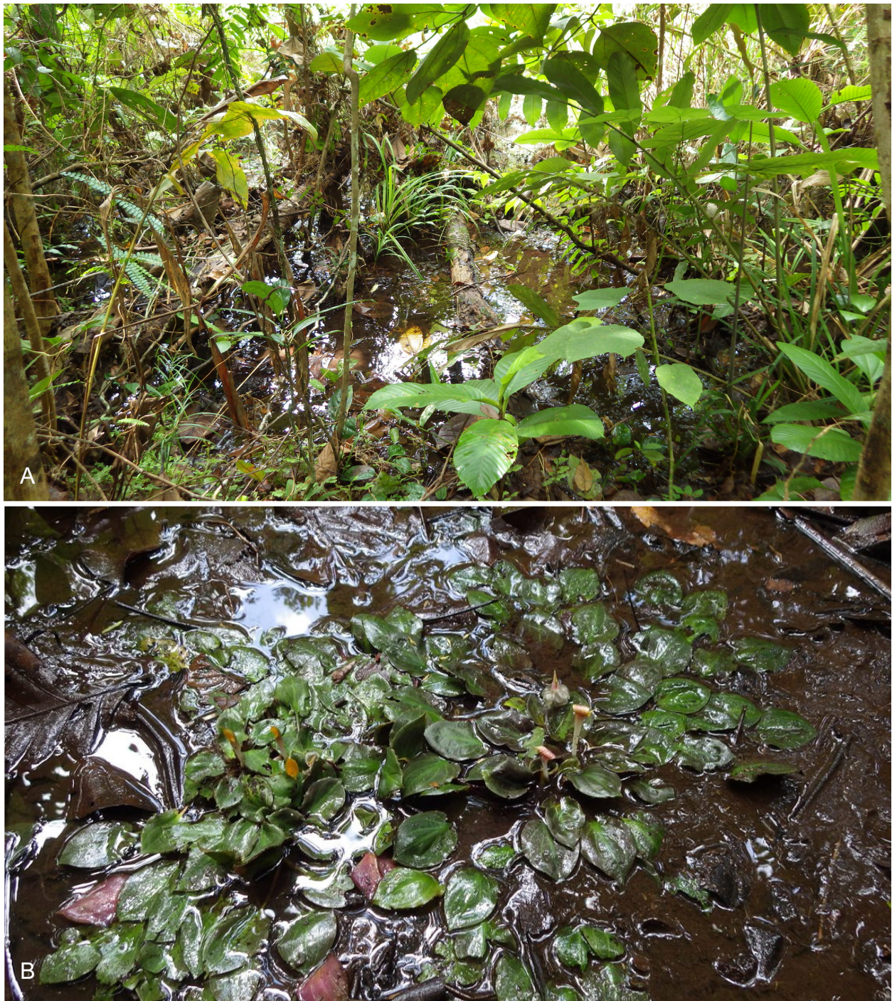
Fig. 2. Cryptocoryne aura – A: habitat at type locality with slower-flowing water; B: close-up of plants in A. – Photographed on 26 February 2015 by S. Wongso.

Etymology — The epithet alludes to the well-developed, slightly transparent, whitish membrane surrounding the leaf margin, which is likened to an aura.