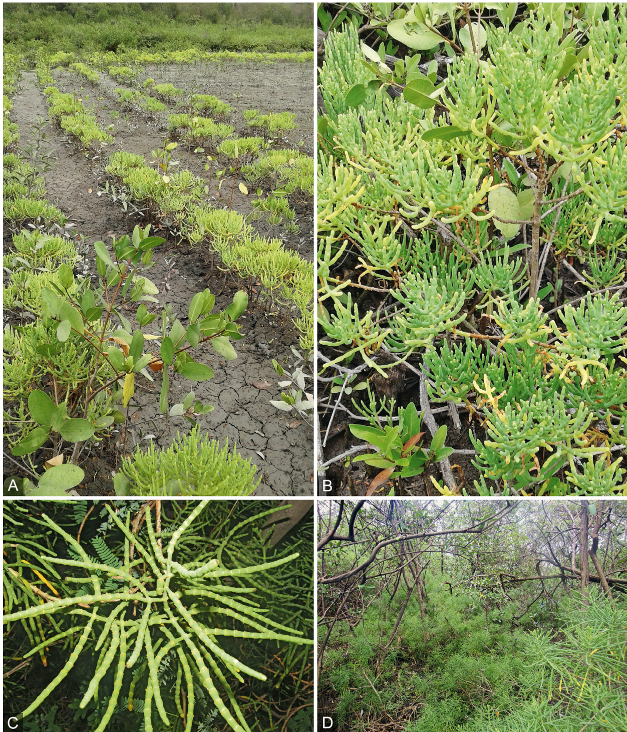
Fig. 1. Mangleticornia ecuadorensis in Reserva de Producción Faunística Manglares El Salado. – A: Open ground with many young plants of M. ecuadorensis in rows (Sep 2016). The occurrence in rows might result from the deposition of the floating disarticulated segments on tidal drift lines. – B: M. ecuadorensis grows as compact, mostly 0.8–2 m high, sprawling shrubs (Sep 2016). – C: The inflorescence consists of branched spikes that are up to 10 cm long and composed of 5–20 fertile segments (27 Jan 2017). – D: One typical habitat of M. ecuadorensis is the understory in an Avicennia germinans stand (27 Jan 2017).

which usually consist of a terminal, unbranched, spike-like thyrse, but shorter branches may arise from nodes beneath the base of the spike. In these instances, the side branches are at an acute angle (relevant to the main axis) and may curve upwards. In both the potentially new plant