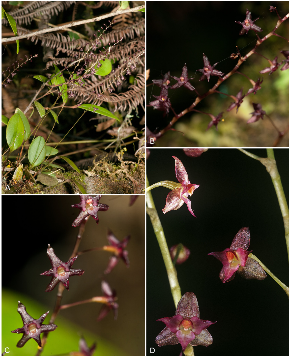
Fig. 2. Stelis machupicchuensis – A: habit of plant; B, C: segments of an inflorescence; D: flowers in close-up. – Photographs: A–C by J. Farfán based on Martel & Farfán 73 (USM!); D by B. Collantes based on the holotype.

2700 m, 20 Mar 2016, C. Martel & J. Farfán 73 (USM! [Fig. 2A–C]).