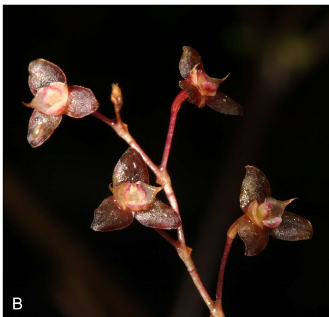
Fig. 4. Flowers of Stelis machupicchuensis (A) and Stelis antennata (B). Note the morphological differences of their lips. Both specimens from the same locality: Wayqecha Biological Station. – Photographs: A by J. Farfán based on Martel & Farfán 73 (USM!); B by R. Repasky based on Repasky & al. 155 (BRIT).