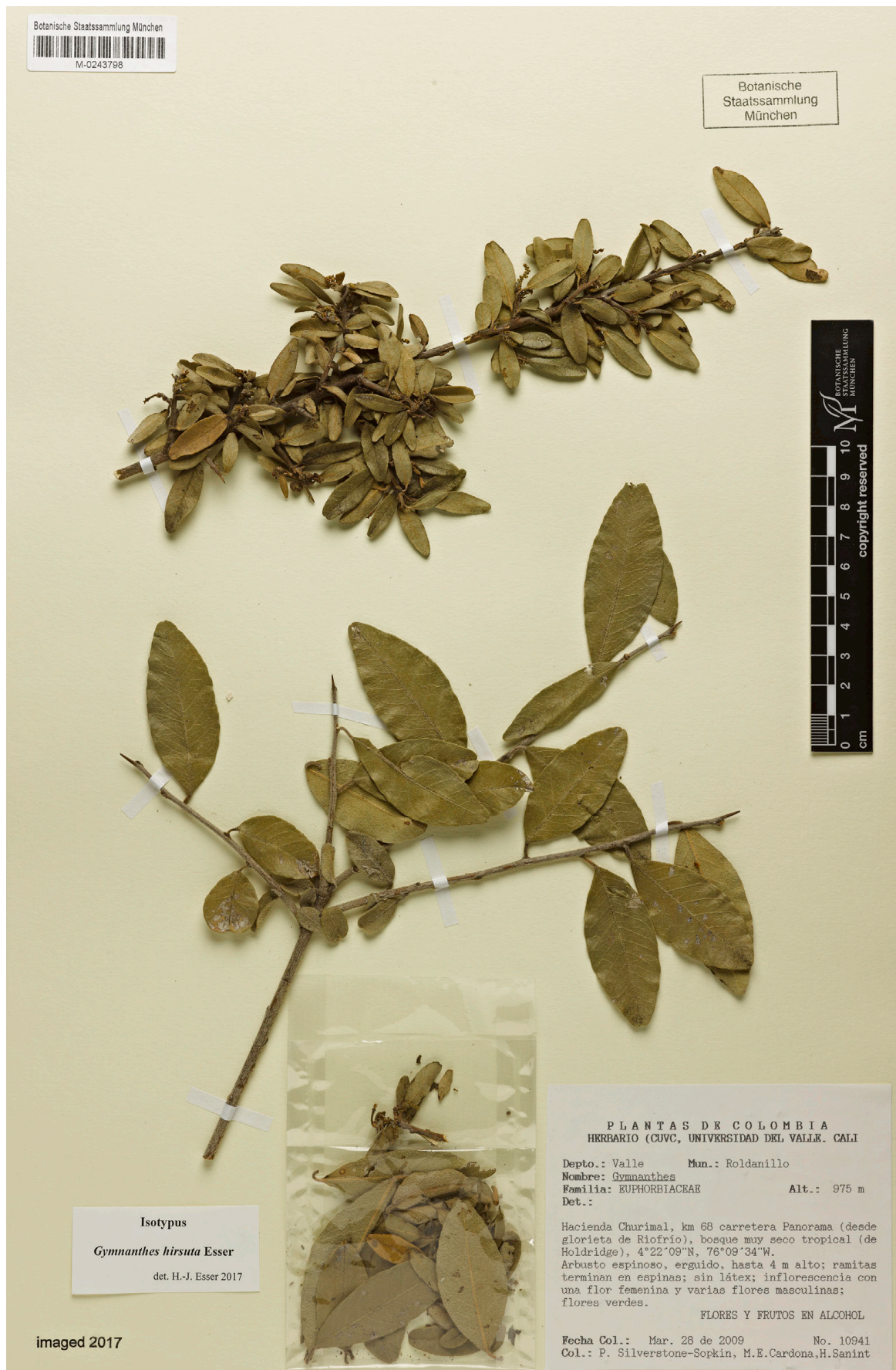
Fig. 1. Isotype of Gymnanthes hirsuta – Silverstone-Sopkin & al. 10941 (M 0243798).