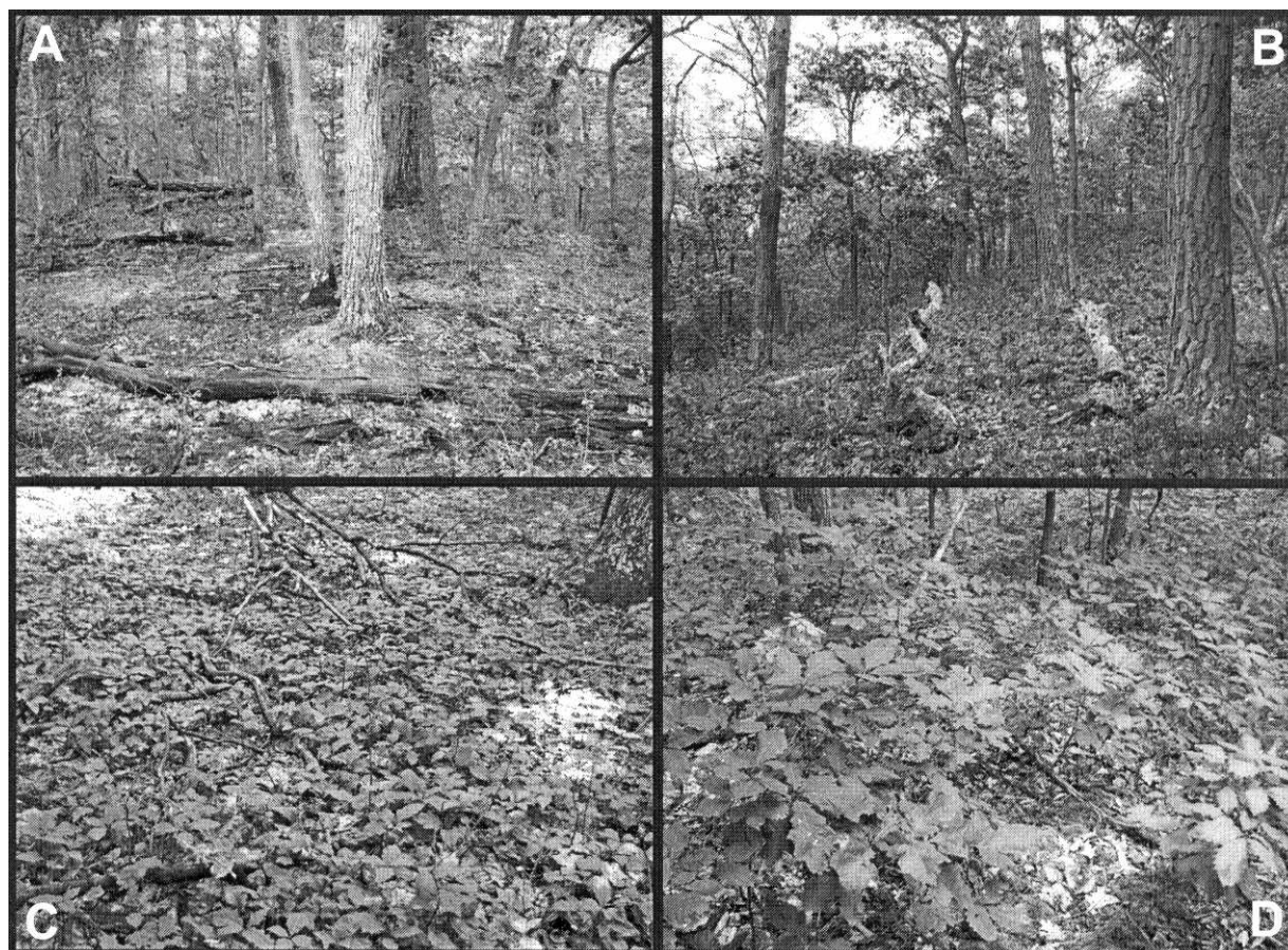
Figure 2. From top left to bottom right- A) July 2011 overview of the spring 2011 prescribed fire in the forest understory at Glory Hill 2 site; B) Red oak and chestnut oak dominated forest at the unburned Oakwood 3 study site; C) Large cohort of red oak seedlings that germinated after the April burn in Old Minnewaska 2 site following a mast year in 2010; D) Large seedling sprouts of red oak and chestnut oak (in 2011) created after the 2009 fire on the Oakwood 2 site.